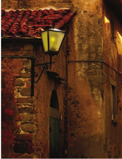
"Tuscan Textures" by Beth Coyle, Digital Print, in The Found Image