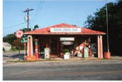
The Waring General Store is part of the "Small Town Texas" exhibit at the Witte Museum in San Antonio. Photographs by Ricardo Romo are in the Focus Gallery from August 22 – October 4, 2009.

Celebrate the photographic arts in the Hill Country at the following exhibits: