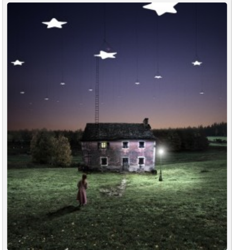
"Les tâches solaires" by Alastair Magaldo

Another exhibit of interest to Missions Unknown readers is There And Back Again: Celebrating The 40th Anniversary Of The Moon Landing . This exhibit features photographs by Apollo 11 Astronauts NEIL ARMSTRONG, EDWIN "BUZZ" ALDRIN and MICHAEL COLLINS from the collection of Jerry Hayes. You can see these actual space photos at Artistic Endeavors Gallery (418 Villita, Building 25, 210.222.2497). This exhibit is on display September 1 – 30, 2009 with viewing hours Mon – Sat 10 am – 6 pm and Sun 12 – 4 pm. There is no opening reception.