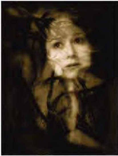
Oyeme con los ojos