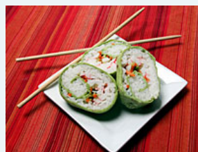
Recipe: Sushi in tortillas