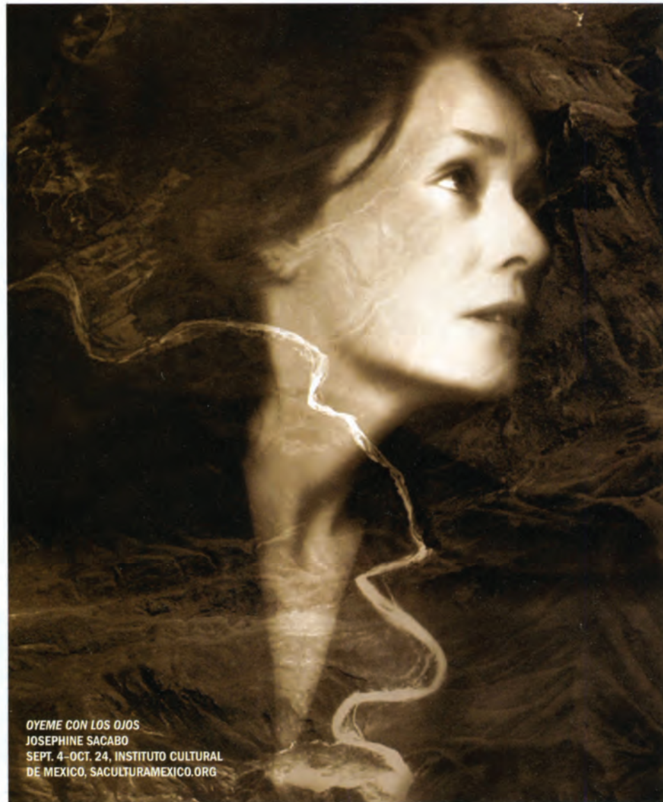
OYEME CON LOS OJOS JOSEPHINE SACABO SEPT. 4–OCT. 24, INSTITUTO CULTURAL DE MEXICO, SACULTURAMEXICO.ORG

Did you know dinosaurs might be ancient birds, not reptiles? Be among the first in the world to see life-size feathered dinosaur models, including Tyrannosaurus rex . Visitors can enjoy the latest technology in animatronics and even control the animated dinosaurs. The exhibit also boasts a fossil dig, dinosaur skeletons and