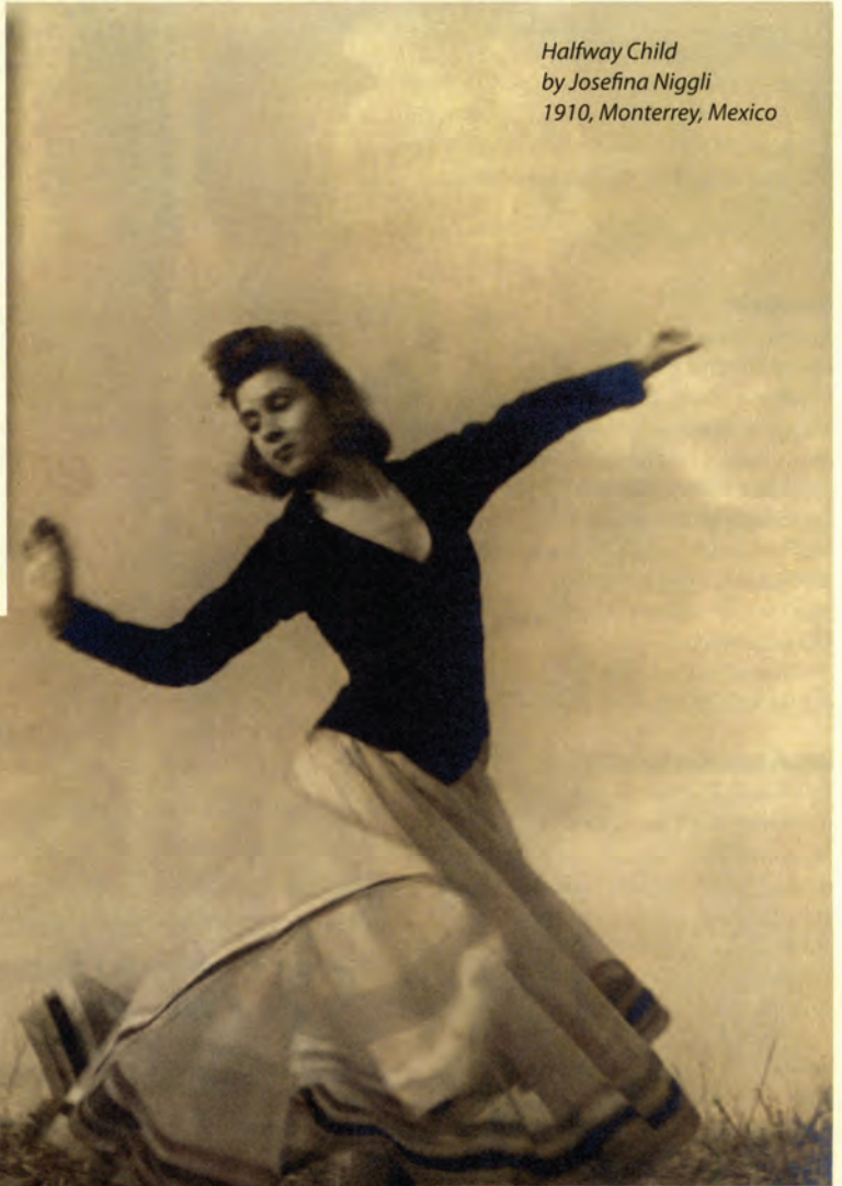
Halfway Child by Josefina Niggli 1910, Monterrey, Mexico

FOTOSEPTIEMBRE organizer/curator Michael Mehl asked Mexican photographers in Mexico, the United States and Canada to submit contemporary interpretations of Mexico's Revolution Centennial and 200 years of independence from Spain for Slanted Glances: Idiosyncratic Interpretations of Independence and Revolution , Sept. 4–Oct. 24 at the Instituto Cultural de Mexico, part of a citywide celebration.