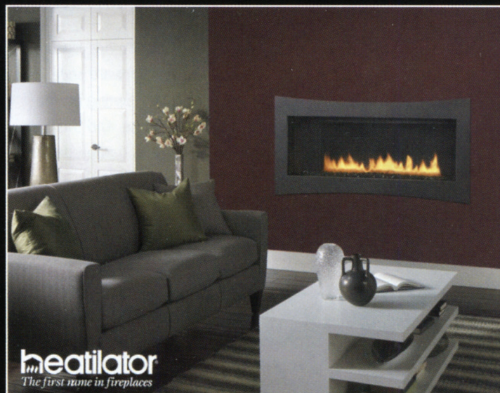
heatilator The first name in fireplaces

Over 25 Working Fireplace Displays 20+ Appliance & Cabinet Vignettes Trained Cabinet Designers Professional Installers