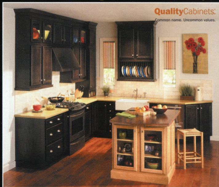
QualityCabinets. Common name. Uncommon values.

Our Home Product Experts Can Make Your Unique Vision A Reality!