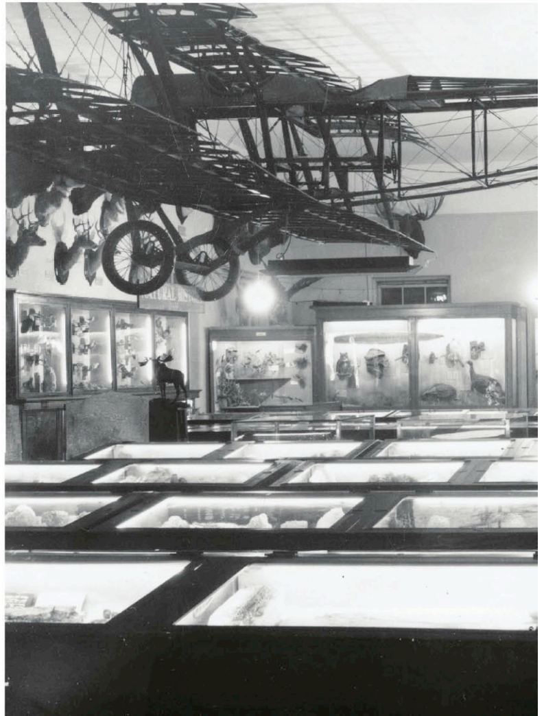
Natural History Display