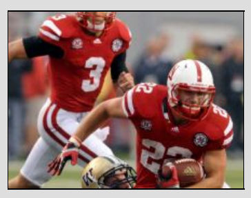
Nebraska line finds success in platoon system