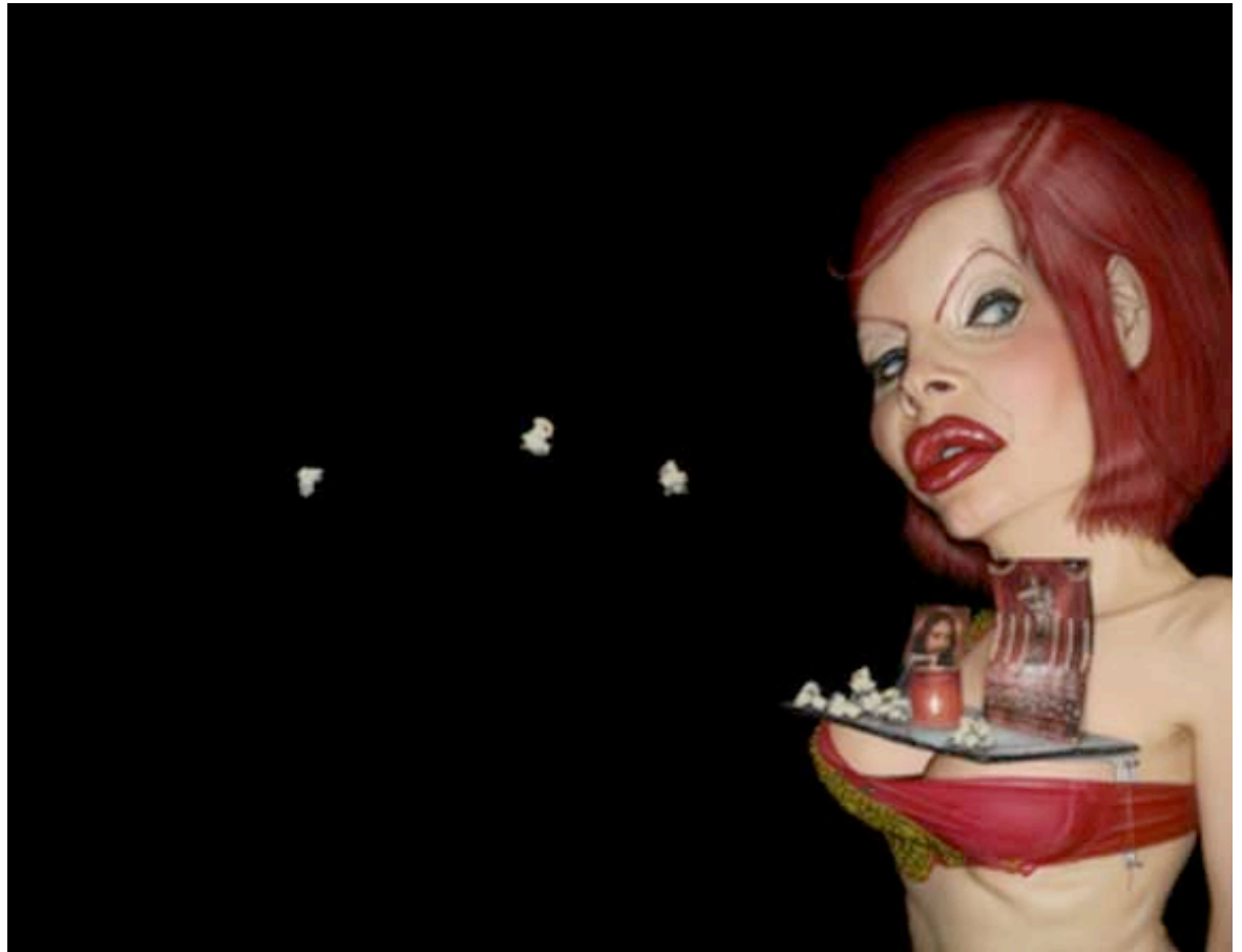
Saul Zanolari, Camp, "Amanda LePore".

SAN ANTONIO, TX.- Fotoseptiembre USA International Photography Festival, which takes place through September 30, every year, in San Antonio, and other cities in Texas. The Fotoseptiembre USA International Photography Festival is a unique and eclectic forum for the exhibition and celebration of photography and photography-based art forms. For over a decade, the Fotoseptiembre USA Festivals have sparked an unprecedented surge of interest in the photographic arts in South Texas. Well established and mid-career artists, respected civic leaders, energized activists and young shutterbugs have added their talents to a burgeoning pool of avid photographic artists and enthusiasts.