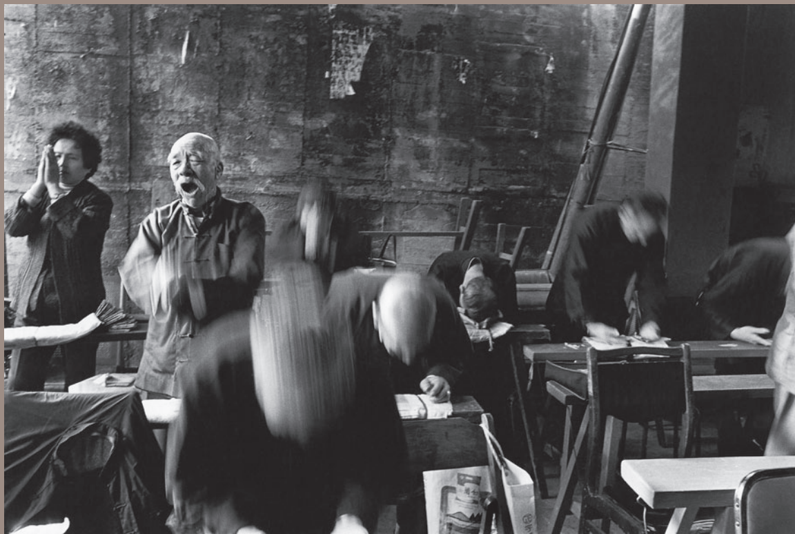
Yonghe, Taiwan, 1983