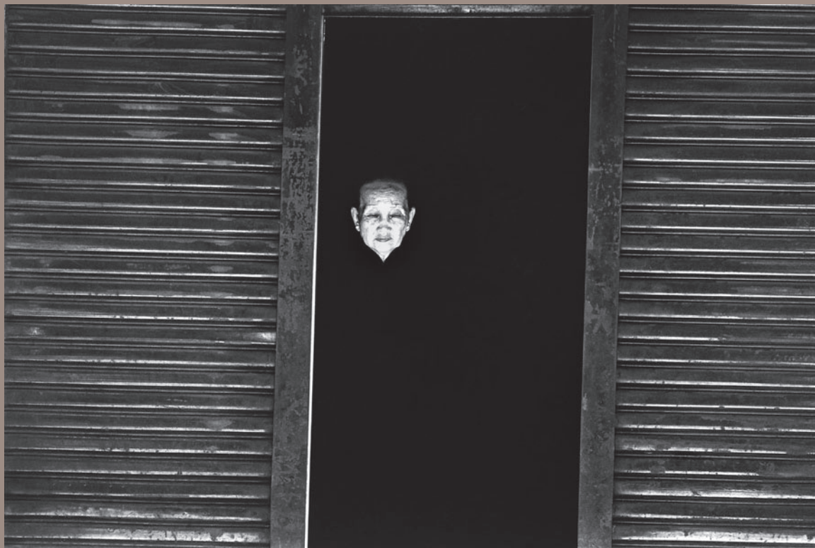
Wanhwa, Taiwan, 1980