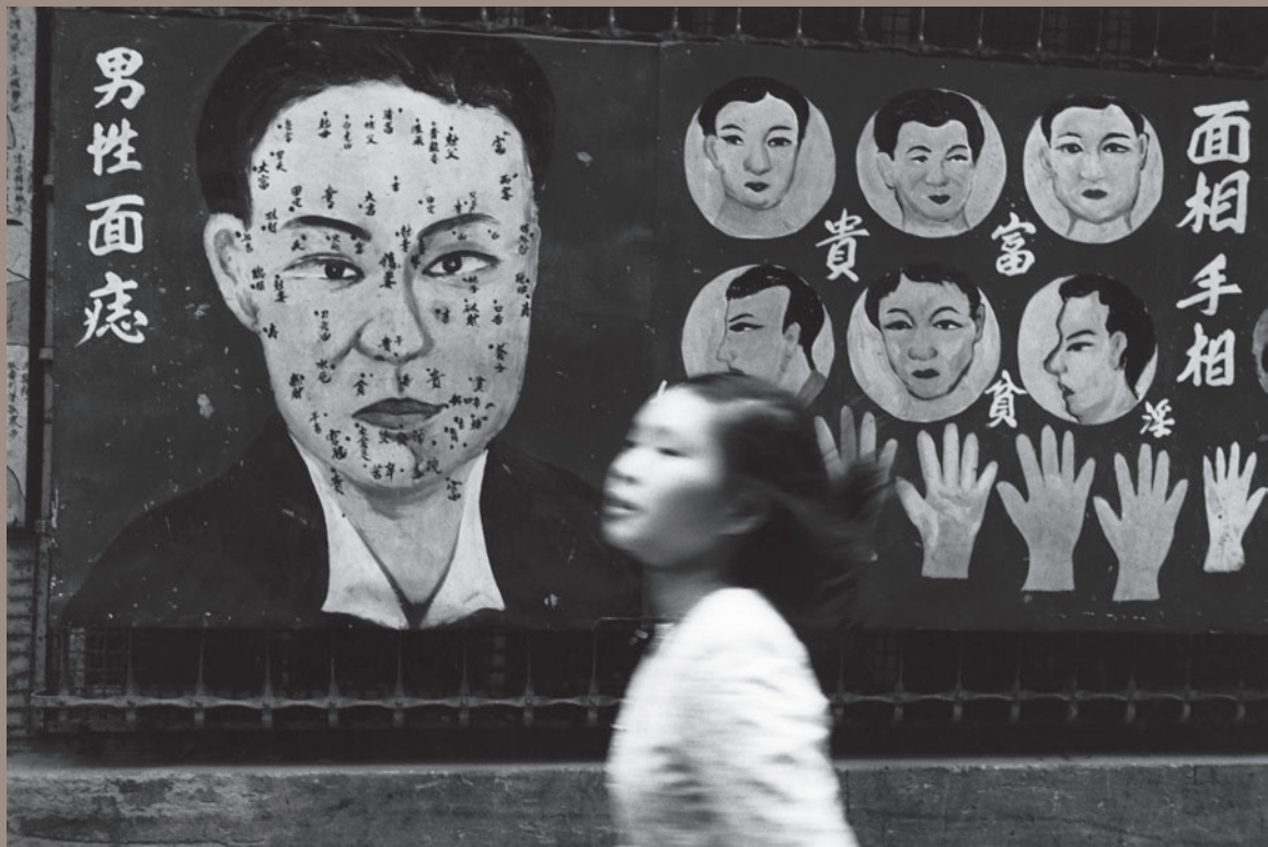
Wanhwa, Taiwan, 1978