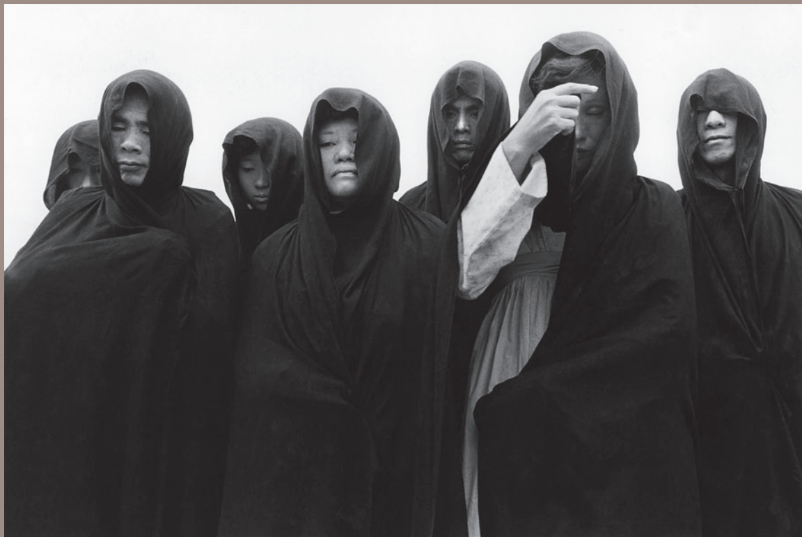
Grass Mountain, Taiwan, 1985