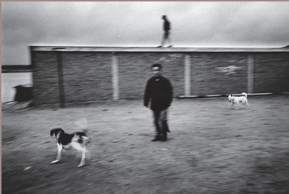
Penhu Island, Taiwan, 1979