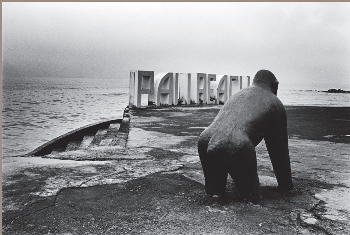
Pali, Taiwan, 1996