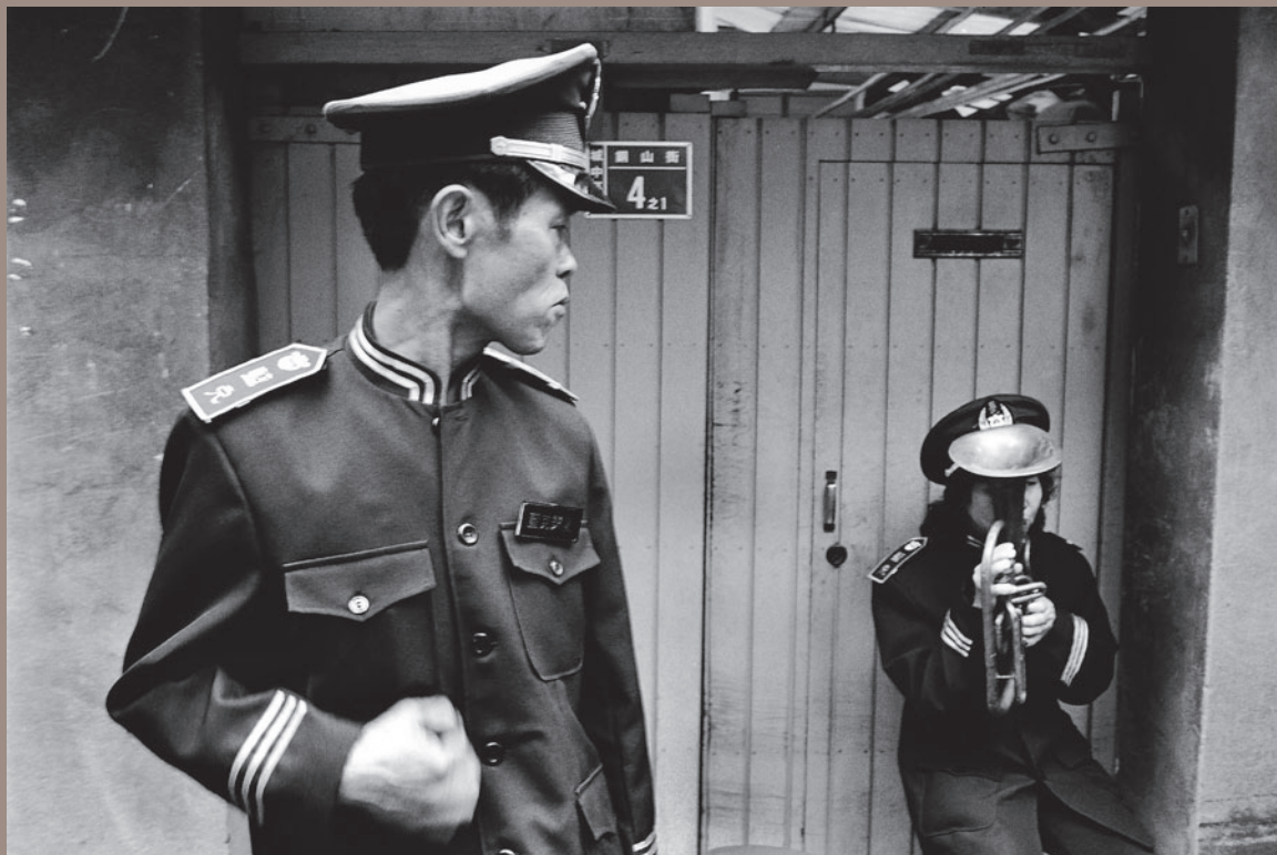
Taipei, Taiwan, 2000