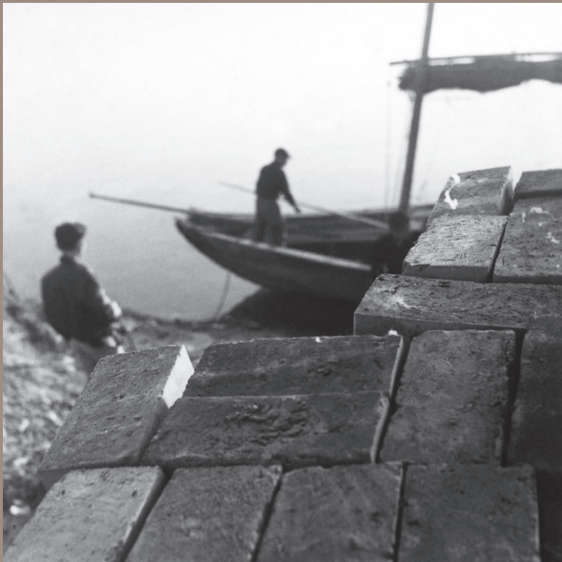
Panchiao, Taiwan, 1960