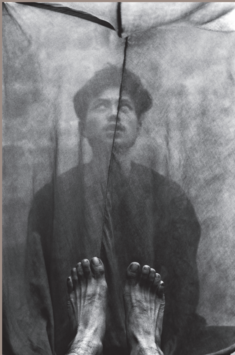
Panchiao, Taiwan, 1963