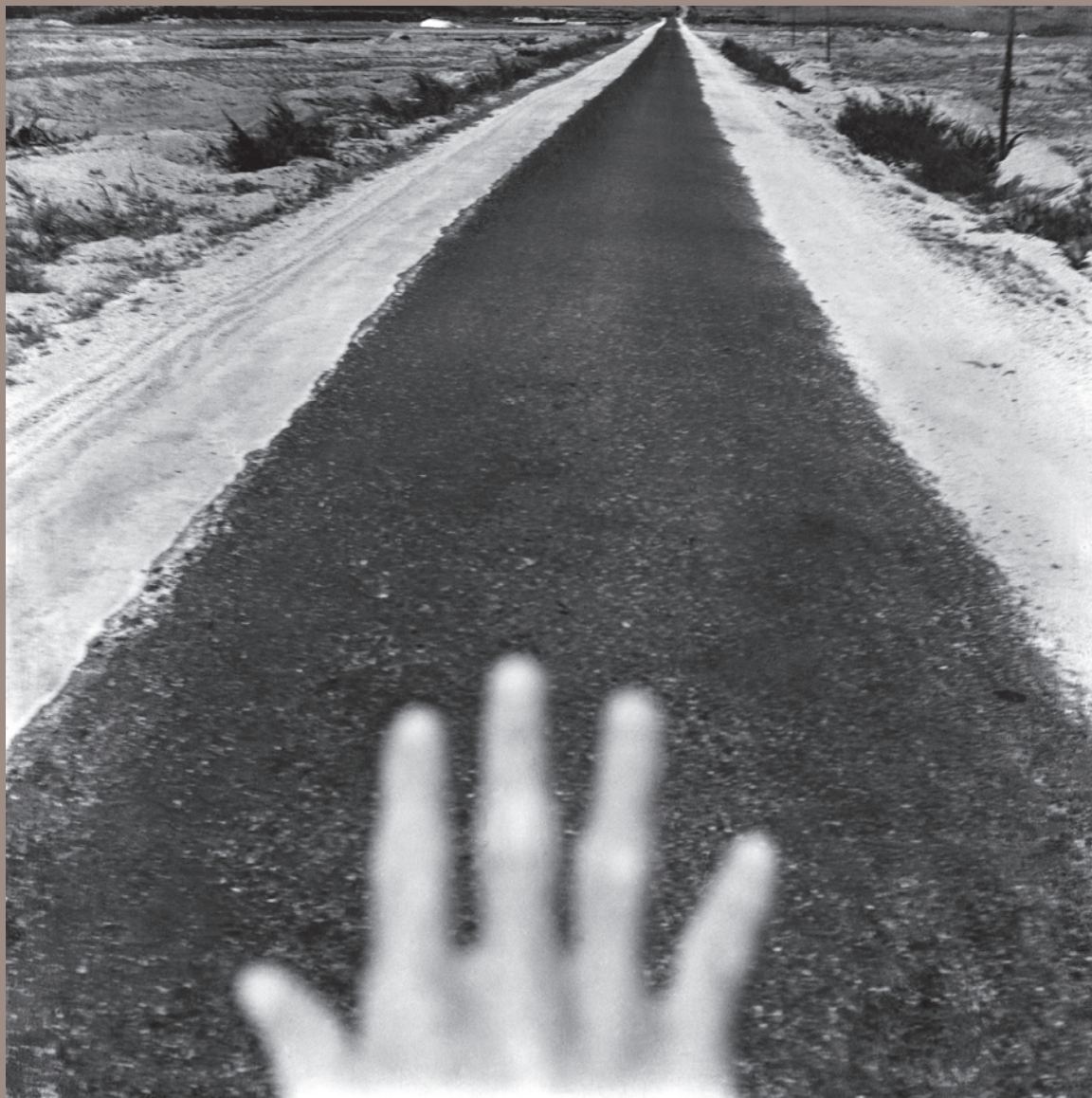
Penhu Island, Taiwan, 1965