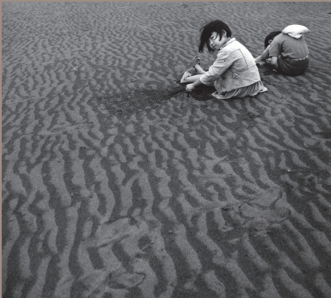
Panchiao, Taiwan, 1960