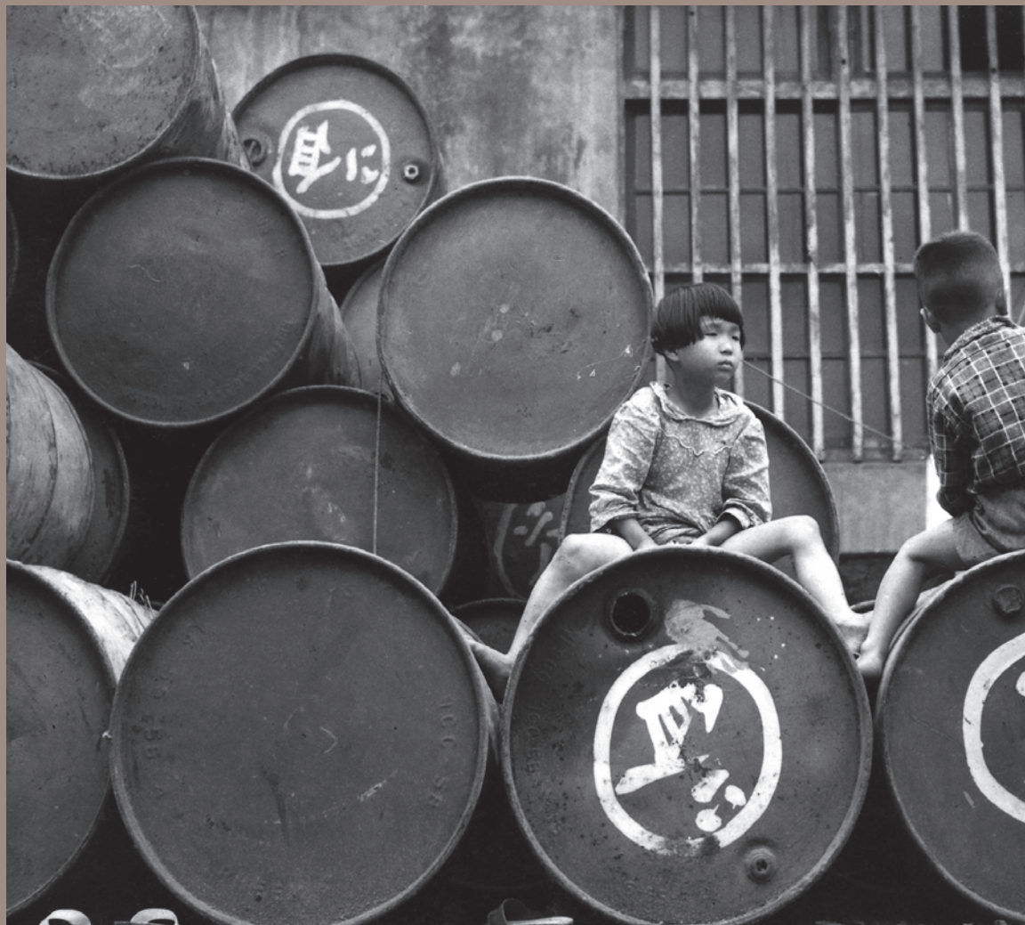
Panchiao, Taiwan, 1961