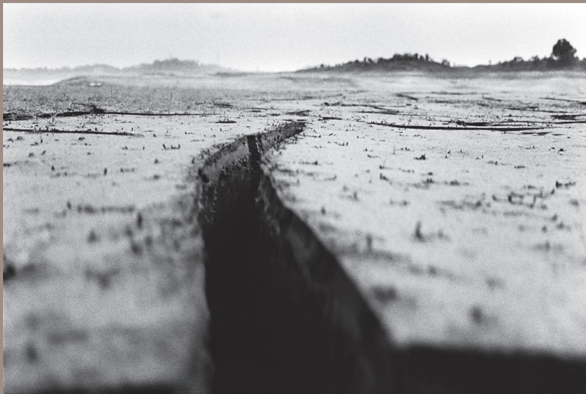
Tainan, Taiwan, 2002