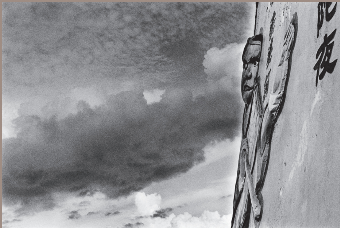
Tainan, Taiwan, 2005