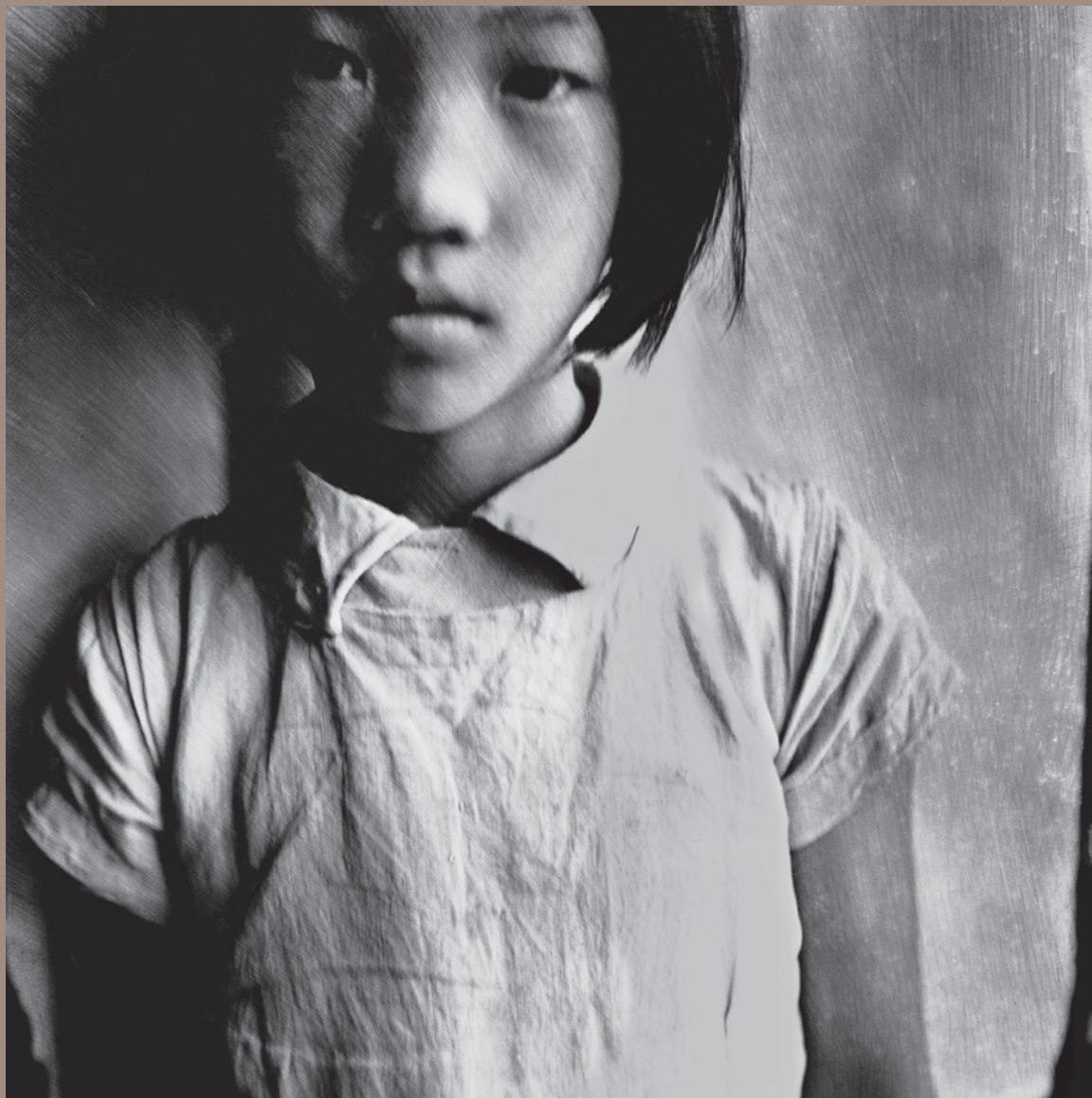
Panchiao, Taiwan, 1963