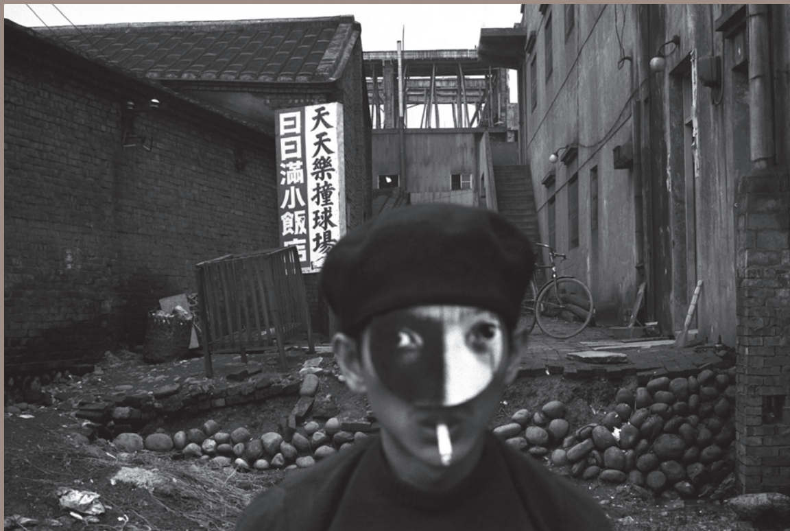
Shinchung, Taiwan, 1964