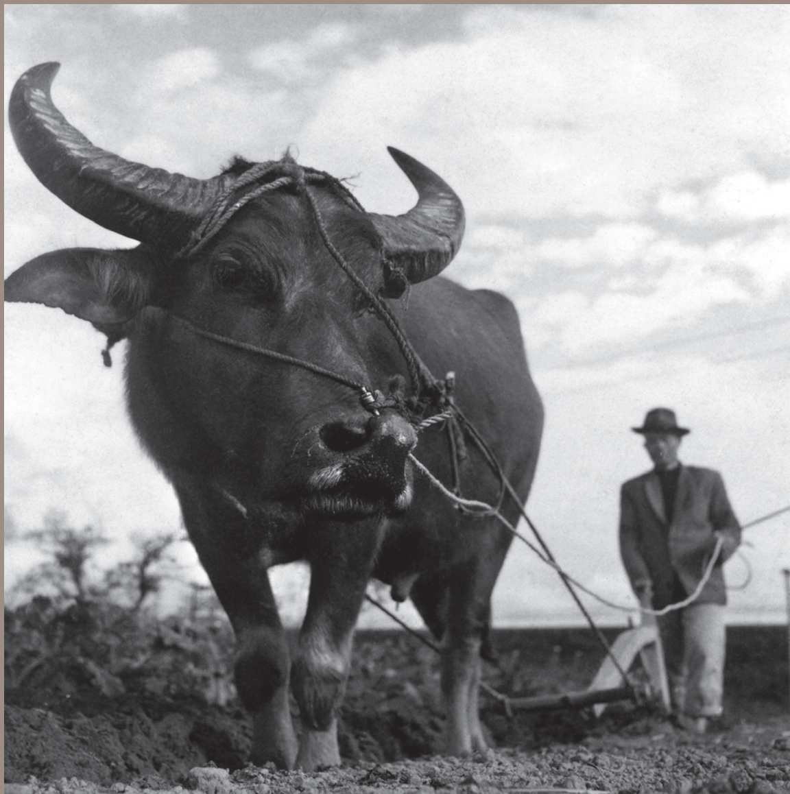
Sulin, Taiwan, 1960