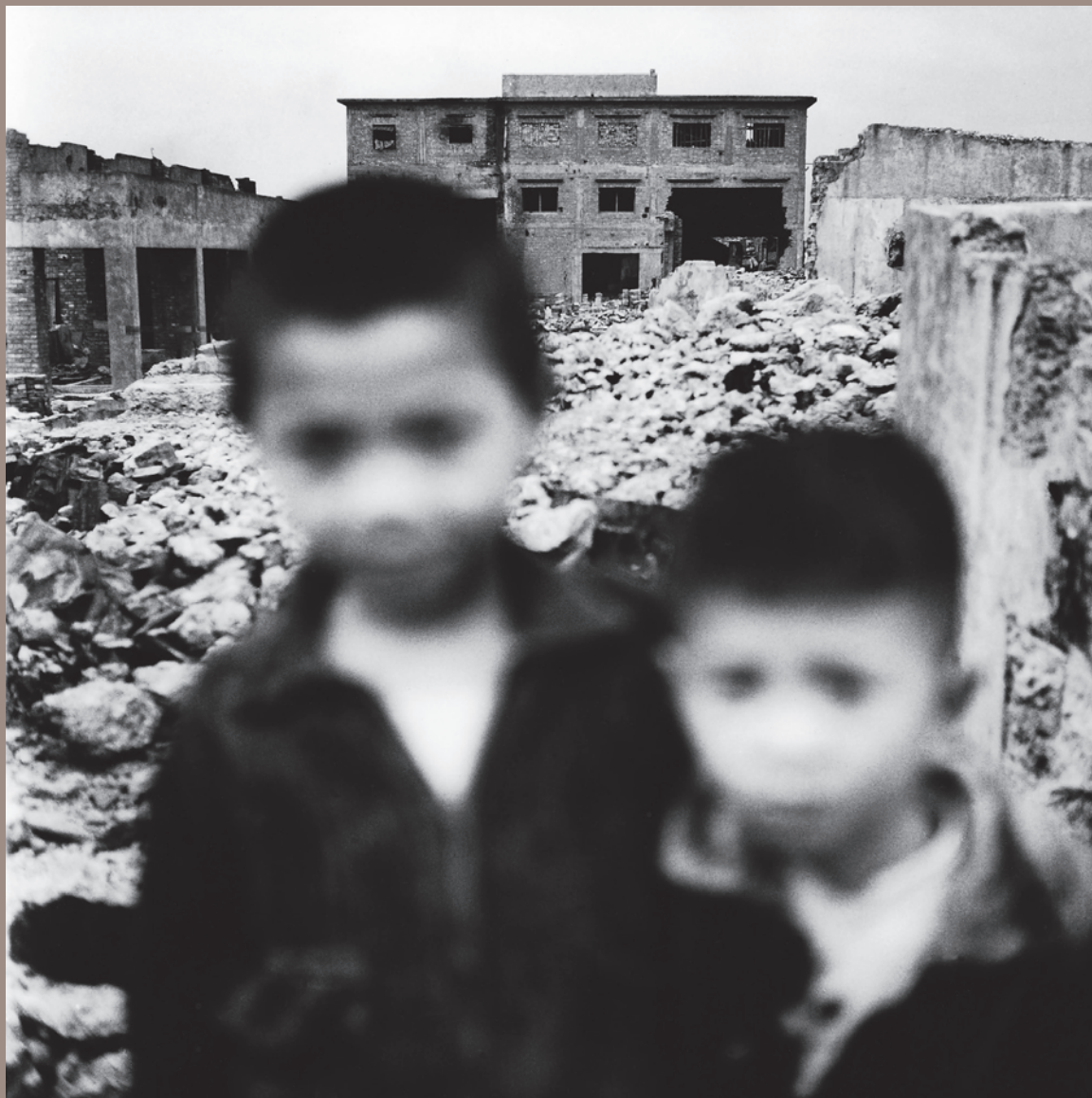
Panchiao, Taiwan, 1963