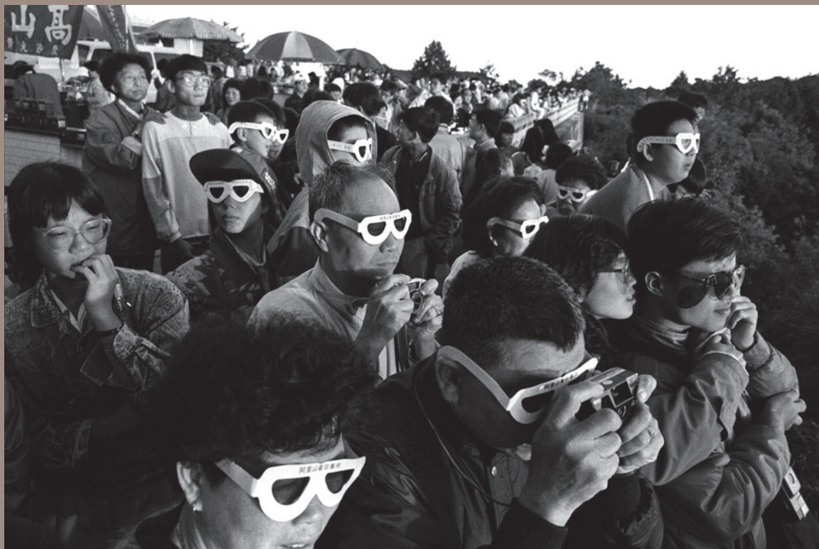
Chiayi, Taiwan, 1990