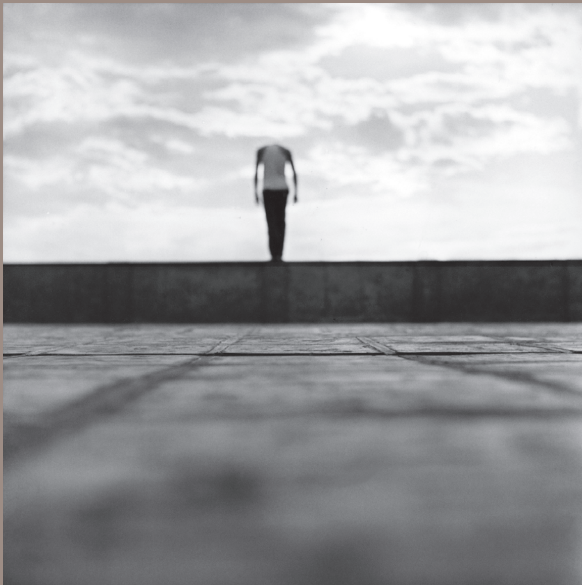
Panchiao, Taiwan, 1962