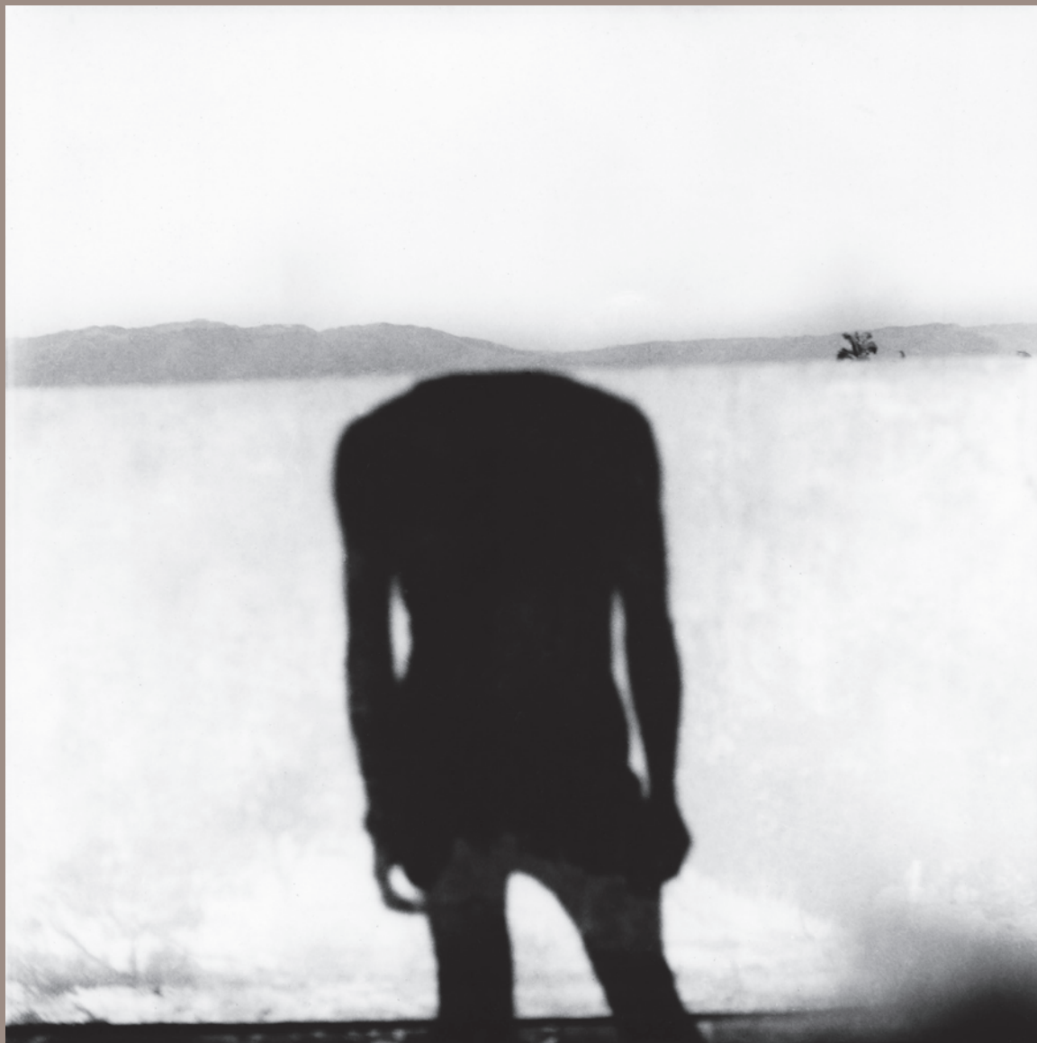
Panchiao, Taiwan, 1962