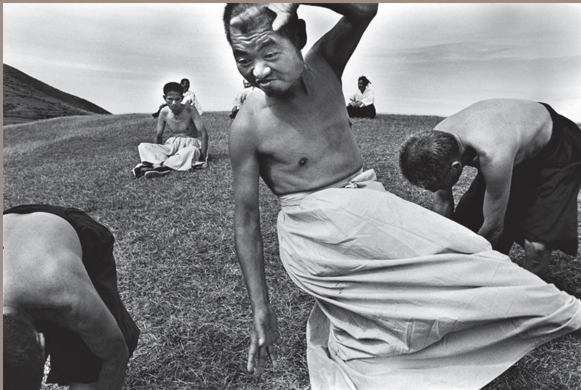
Grass Mountain, Taiwan, 1985