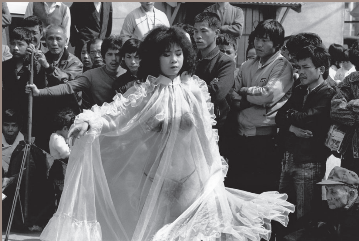
Sansia, Taiwan, 1985