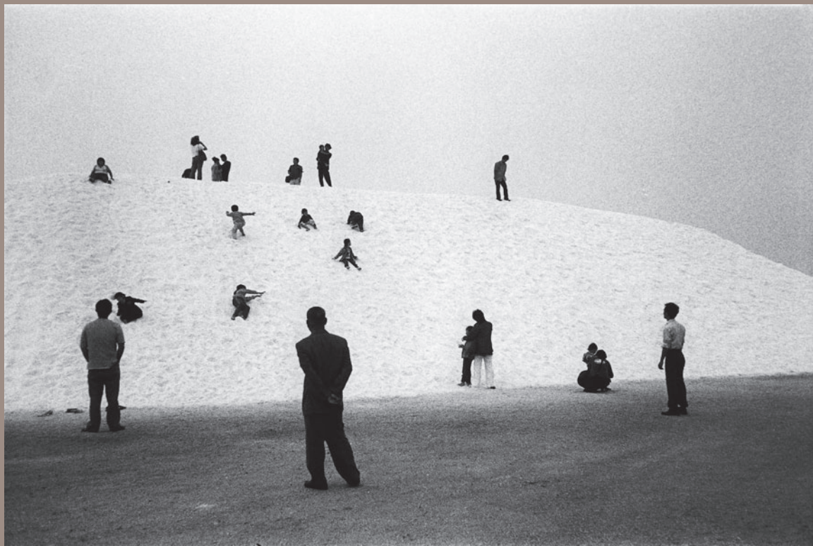
Tainan, Taiwan, 2000