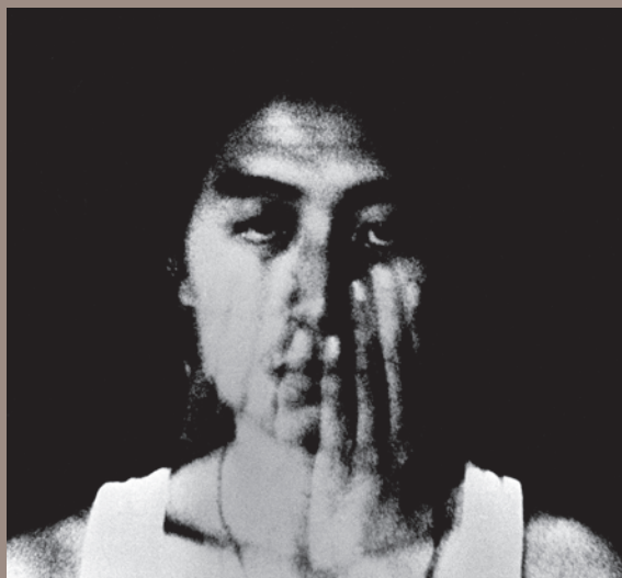
Self Portrait Series • Taipei, Taiwan, 1970