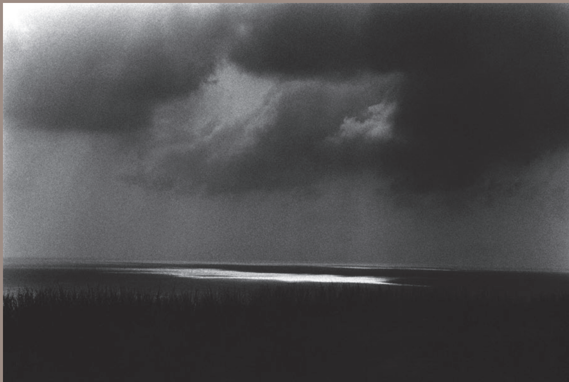
Penhu Island, Taiwan, 2004