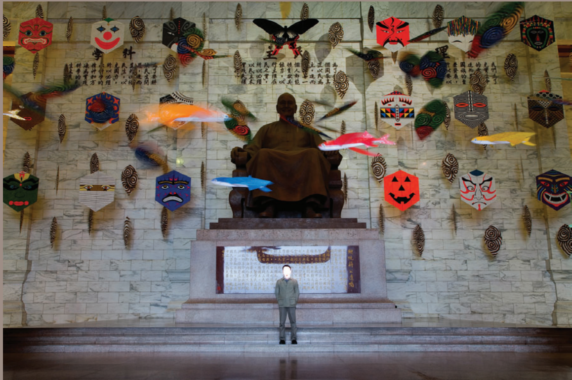
Taiwan Democracy Memorial Hall