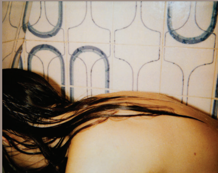
Bémol Diptych 5