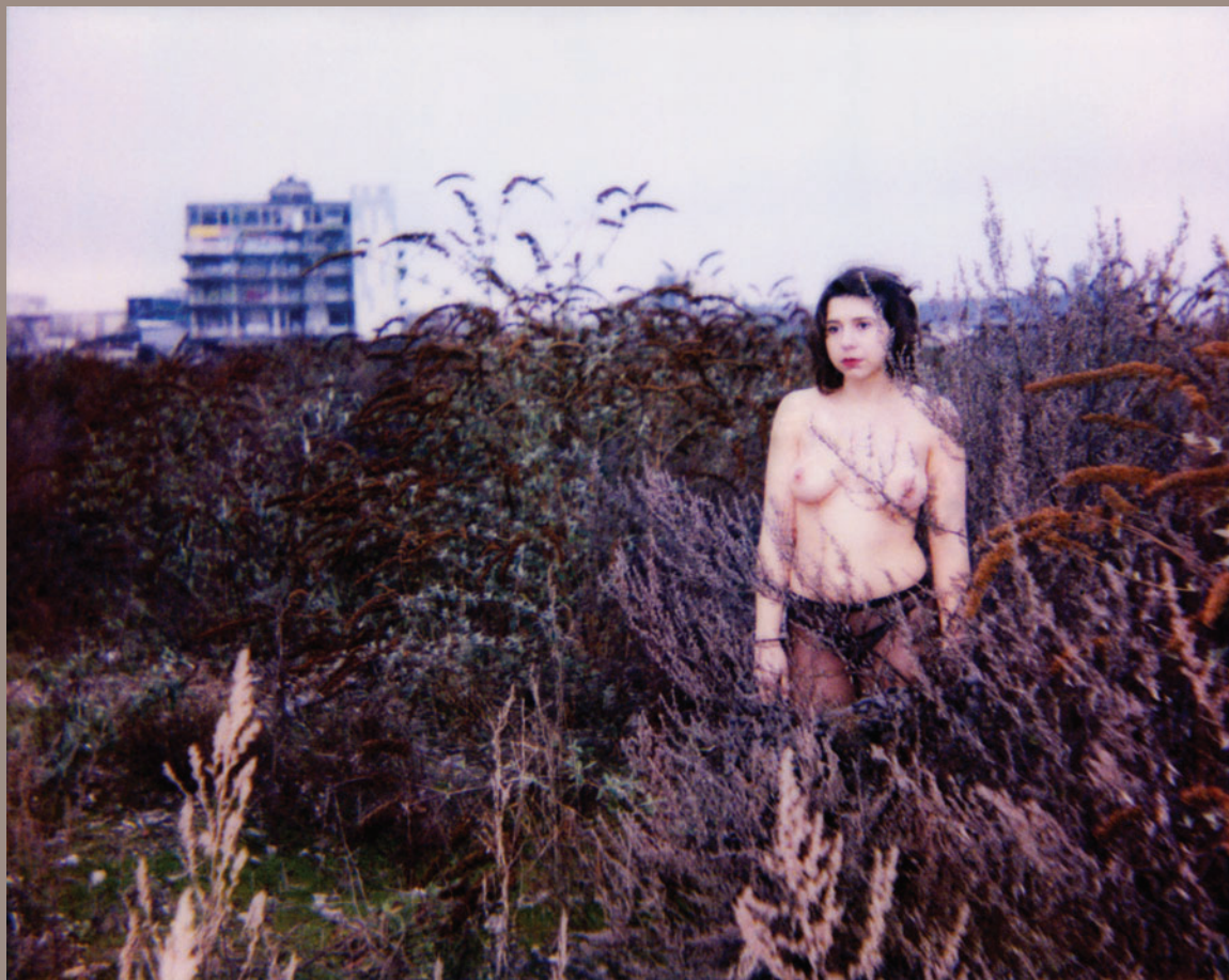
Grises Chairs (5 of 5)