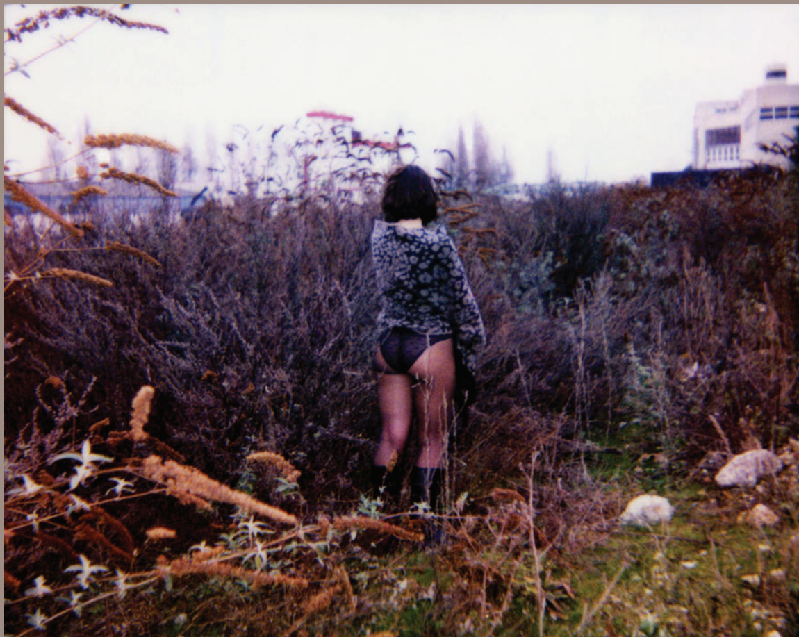
Grises Chairs (3 of 5)