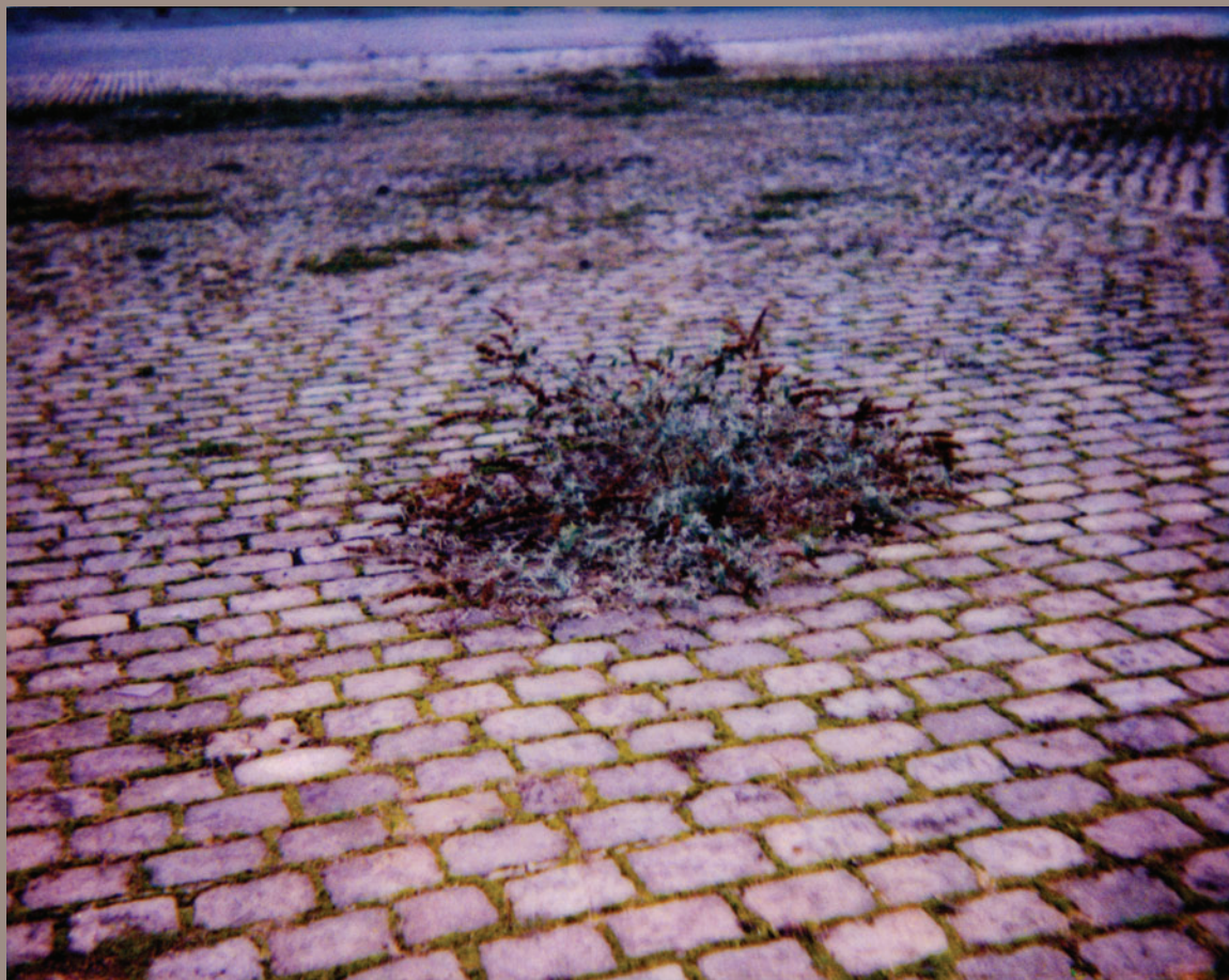
Grises Chairs (1 of 5)