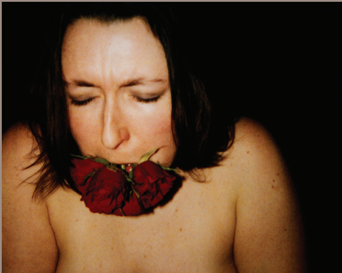
Bémol Triptych (3 of 3)