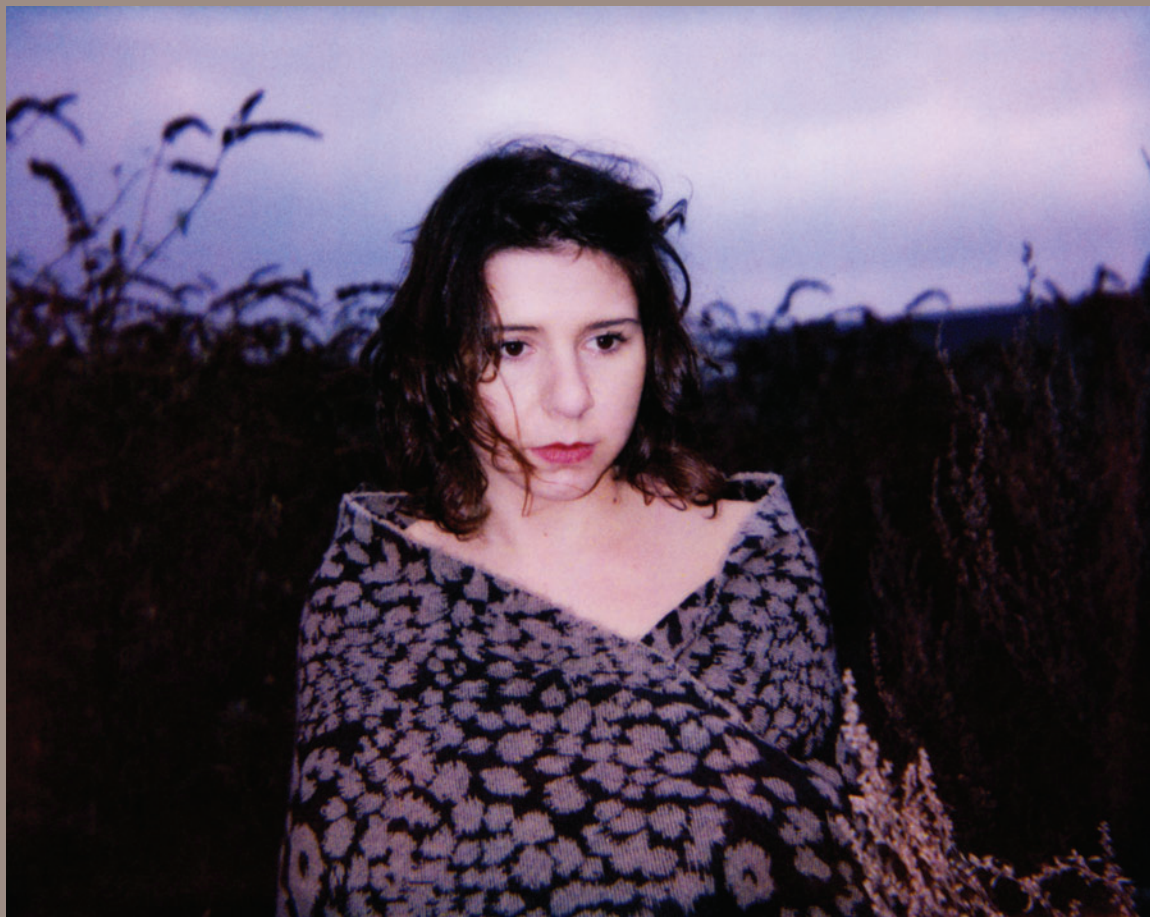
Grises Chairs (2 of 5)