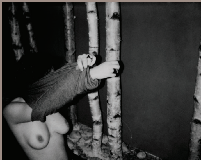
Bémol Diptych 3