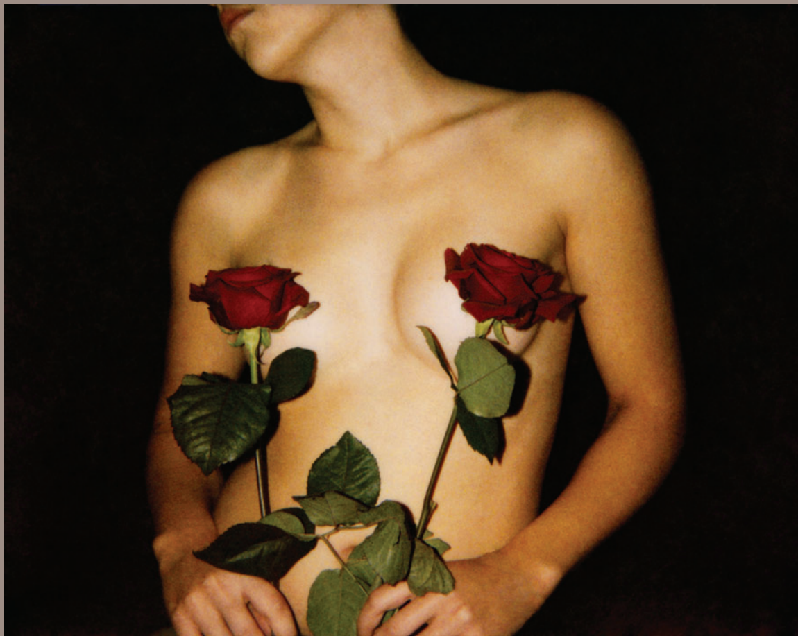
Bémol Triptych (2 of 3)