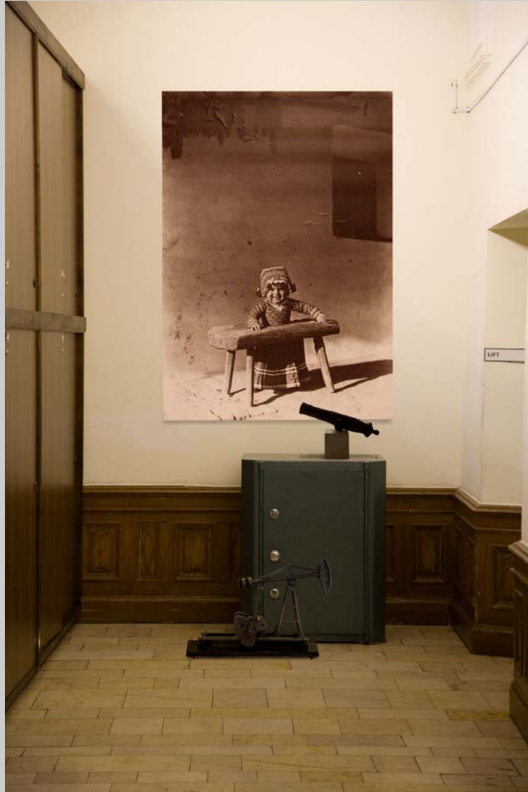
Aus Zeiten der Technischen Revolution