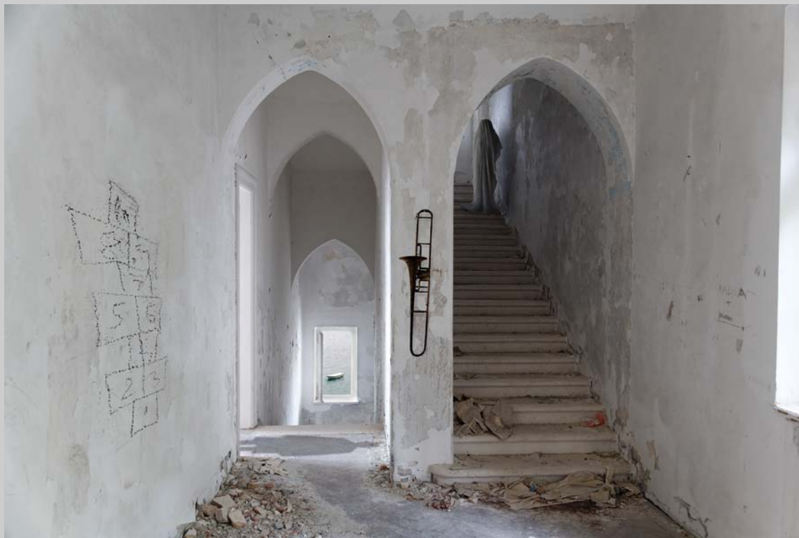
Haus der Gefangenen Träume