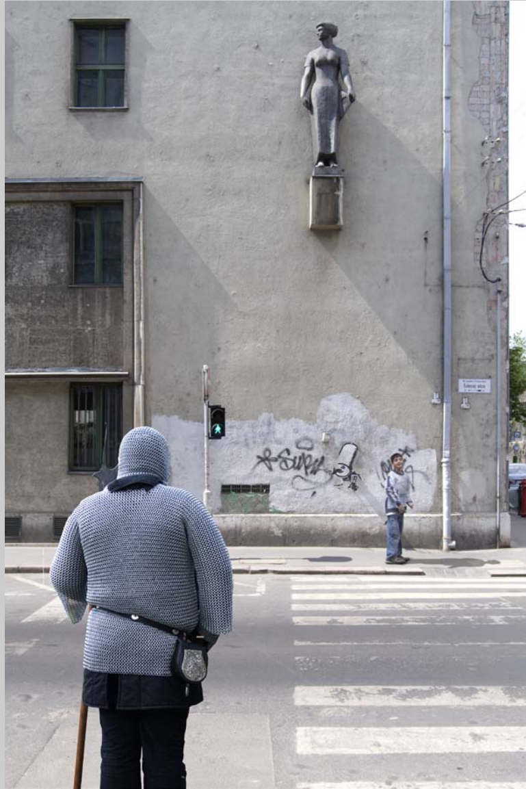
Mutter Courage, Landsknecht & Generation Hip-Hop