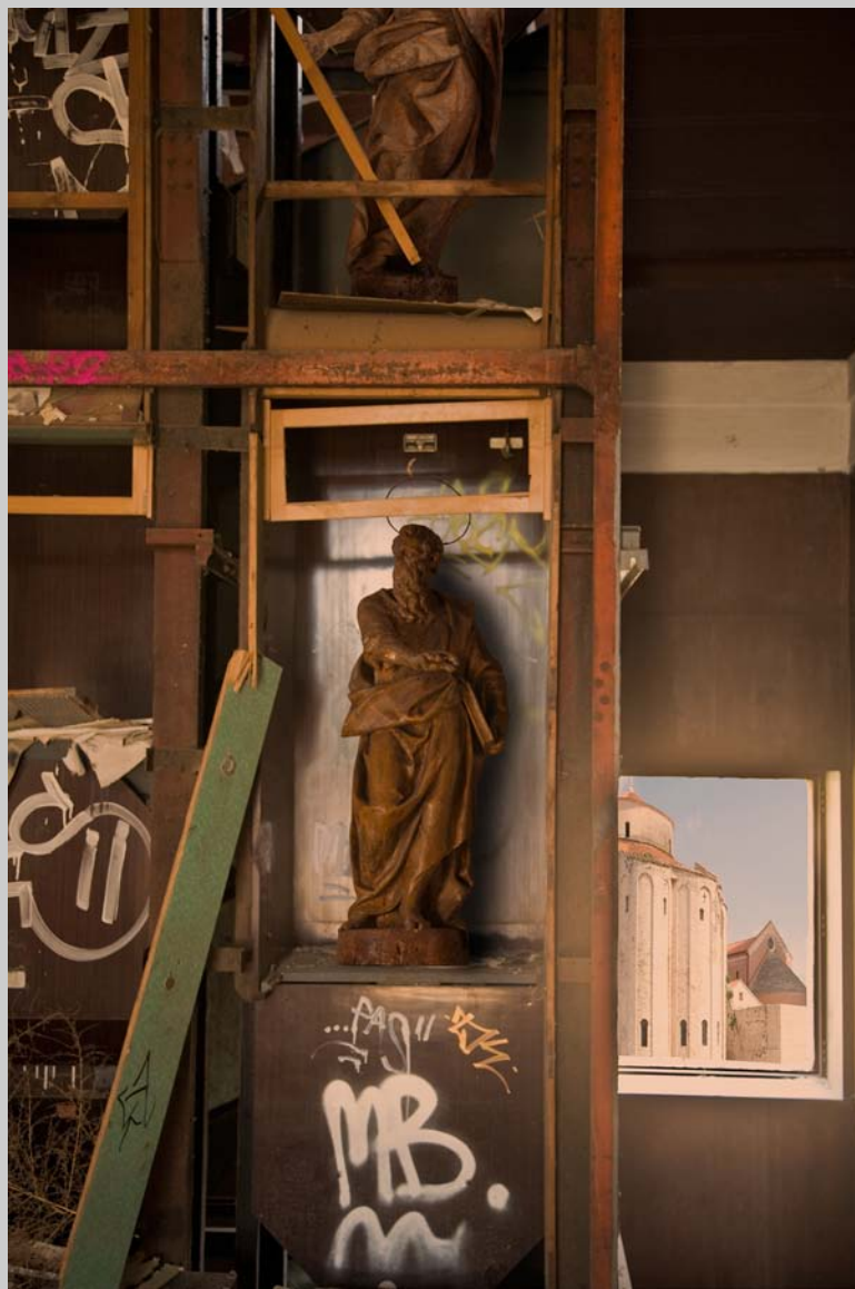
Frater Noster im Pater Noster