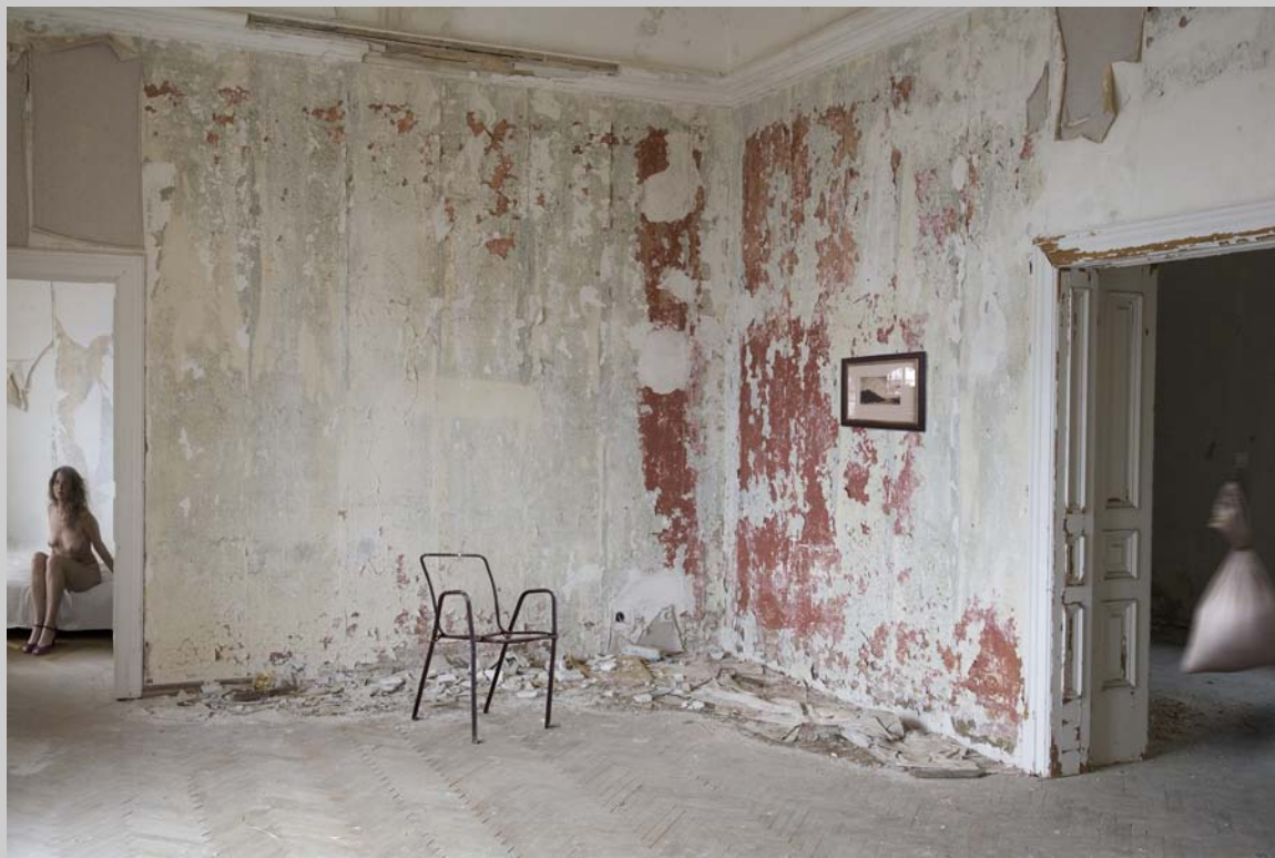
Haus der verlorenen Freuden