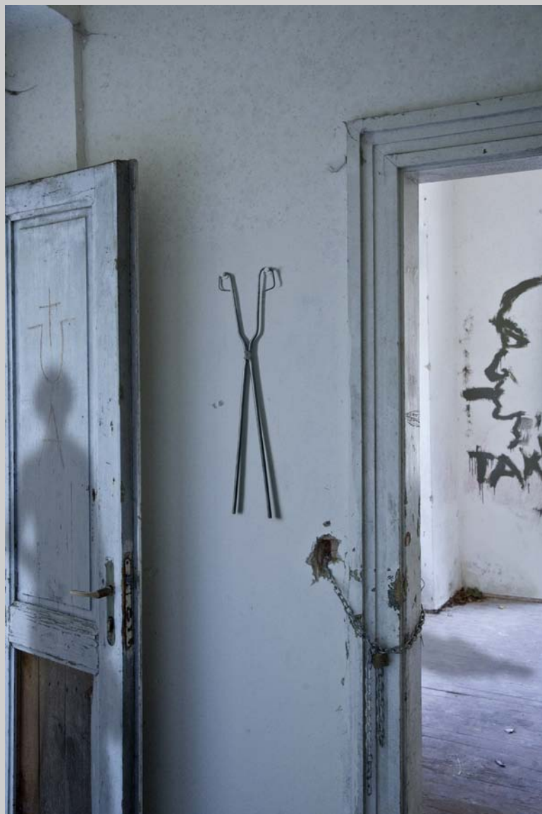
Haus der Schrecken