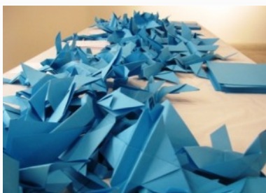
Blue doves for peace in the 31K Portraits for Peace exhibition.

In addition to the photographs hanging on the walls, the exhibit was also incorporated three video displays and an origami station. The videos showcased the "31K Portraits for Peace" project, providing information on the campaign. The origami station, complete with instructions and blue paper, was "an interactive component in which San Antonioans can contribute to fostering messages of peace by submitting photos of blue paper doves to a social media archive." (Excerpt from the 31K Portraits for Peace exhibition description)