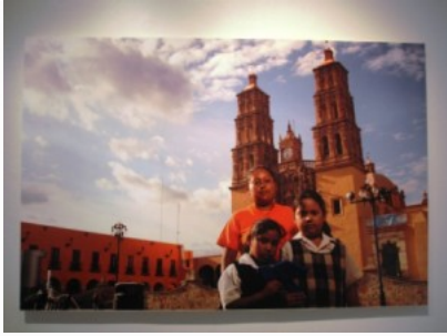
Dolores Hidalgo, Guanajuato

The photos show everyday people who stopped their tasks to hold a paper dove. The idea behind the "31K Portraits for Peace" project is straightforward: capture individuals in their daily lives to raise awareness and hope about casualties of drug wars. The pictures in the 31K Portraits for Peace exhibition went a step further, and displayed people who were willing to take the time to stand up for peace. Their message is as powerful and impressive as the massive vinyl images mounted on the walls.