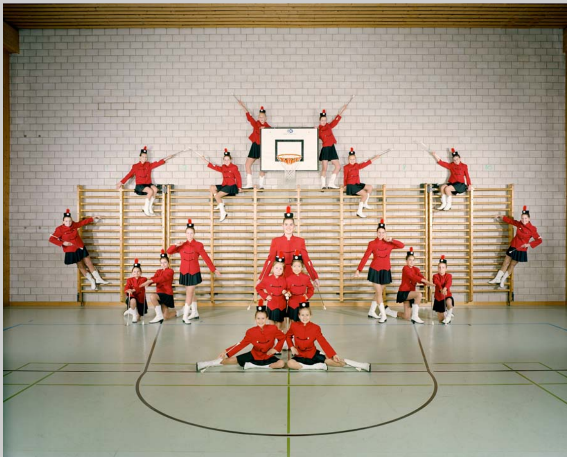
Majorette & Show Dance Troupe