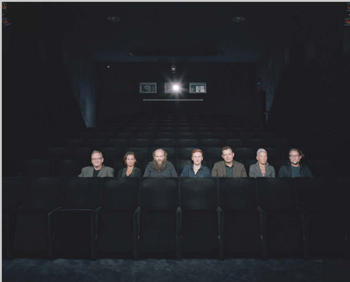
Film Appreciation Group