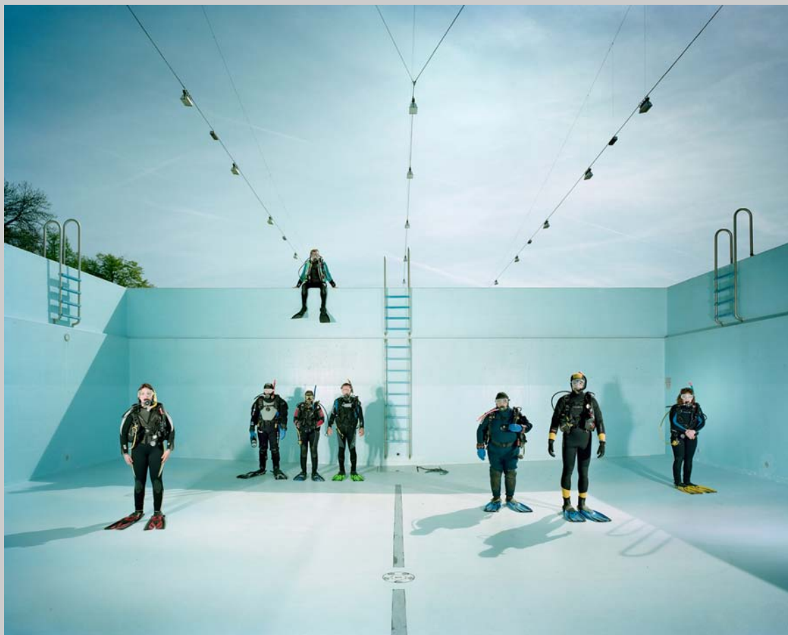
Dintefisch Diving Club