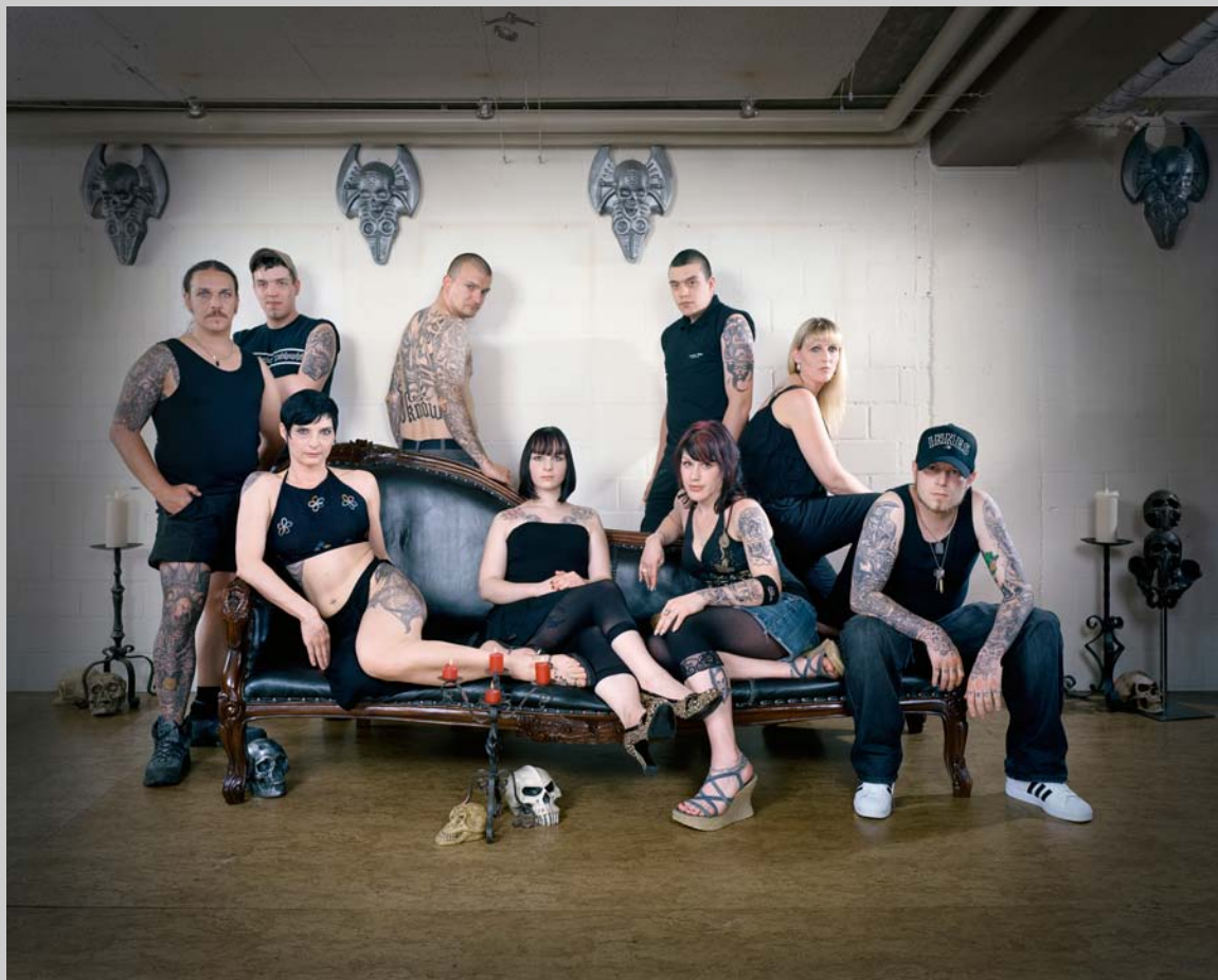
Friends of the Tattoo