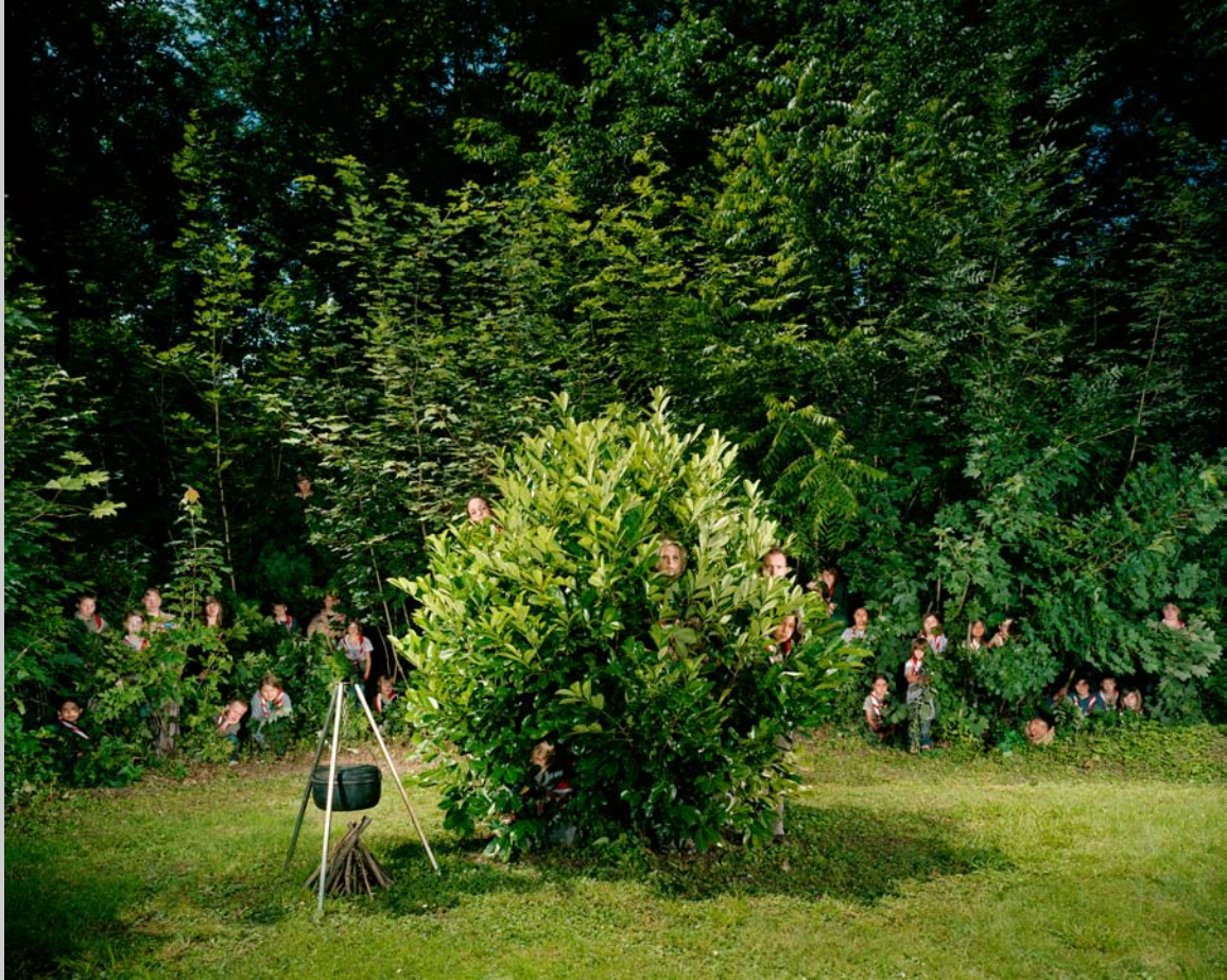
St Brandan Scout Section