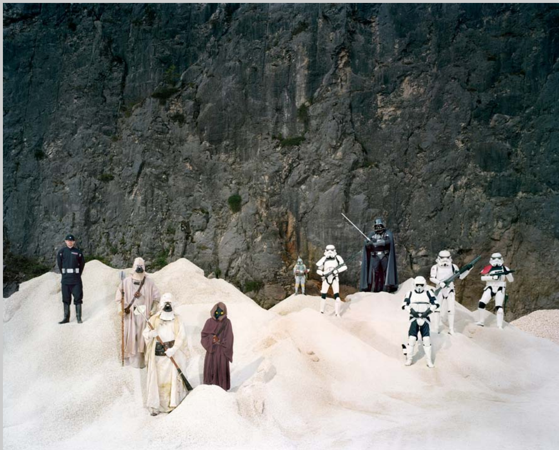
Swiss Garrison (Serving the 501st Legion)