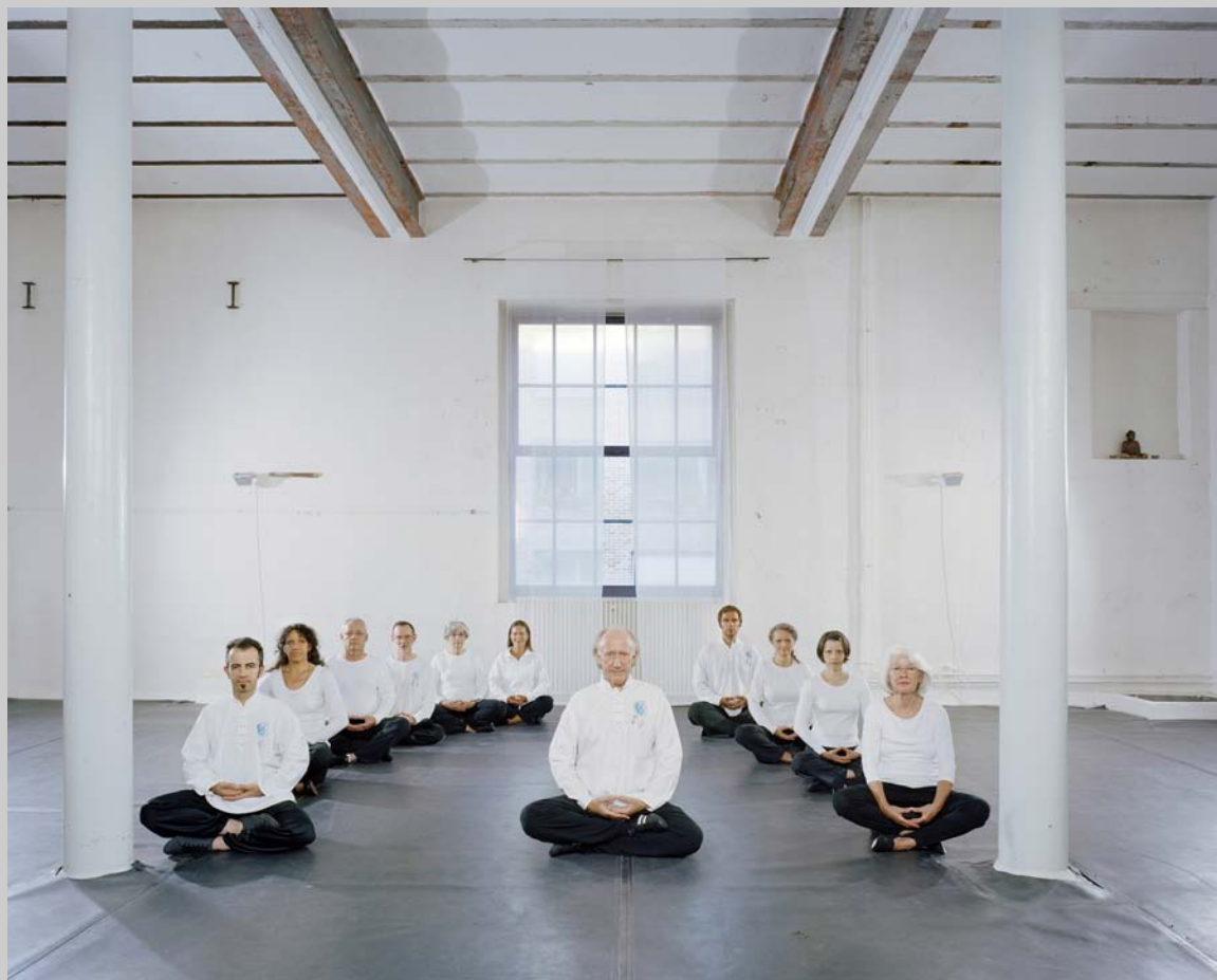
Quiet Room, Tai Chi and Qigong