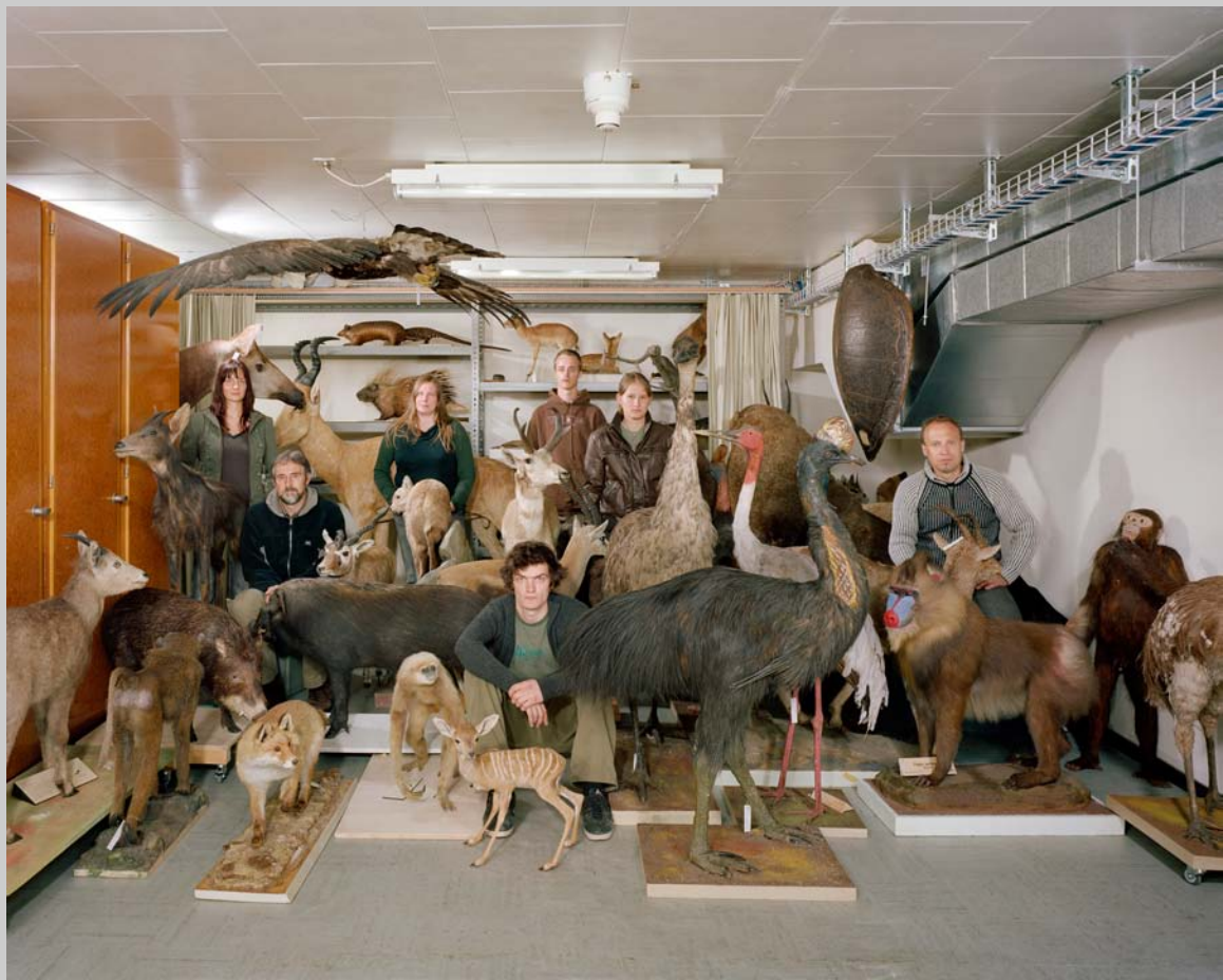
Association of Scientific Preparators