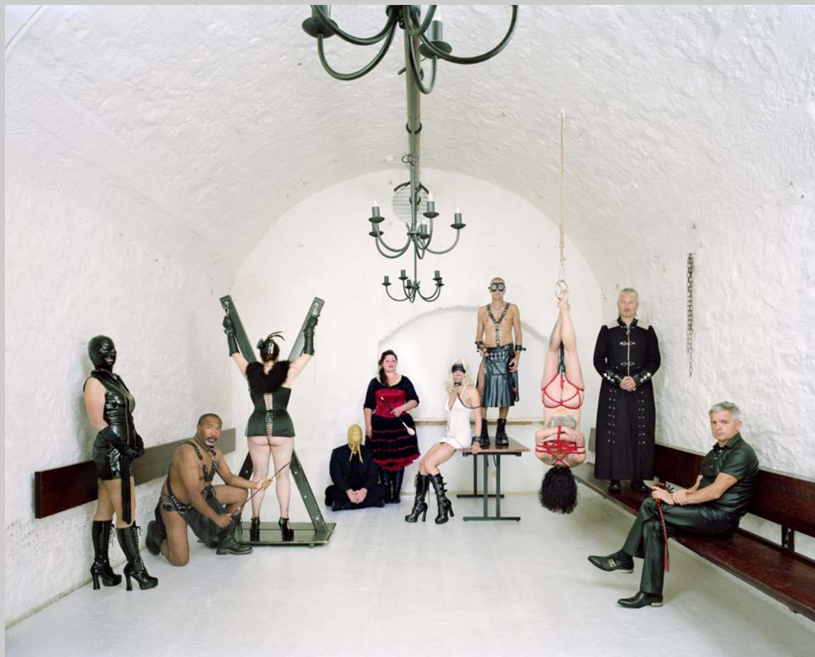
BDSM Regular's Table