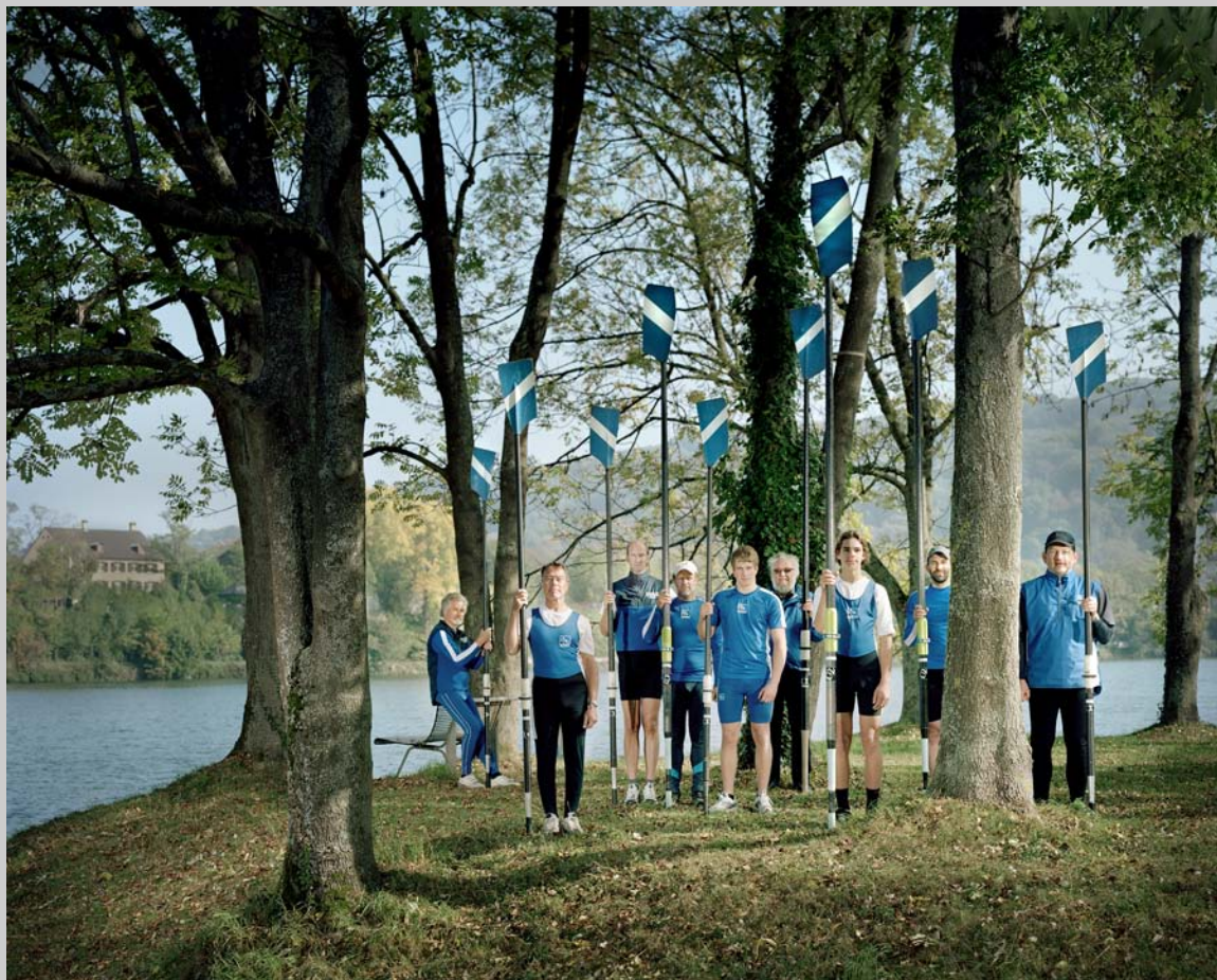
Blue and White Rowing Club