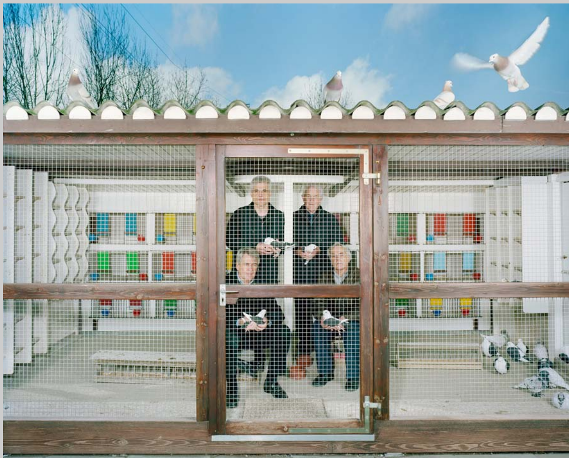
Pigeon Fanciers' Club