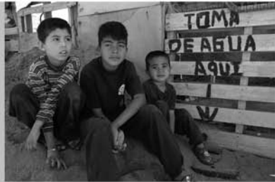
Exhibit on display:

City of San Antonio International Center 203 South Saint Mary's San Antonio, TX 78205