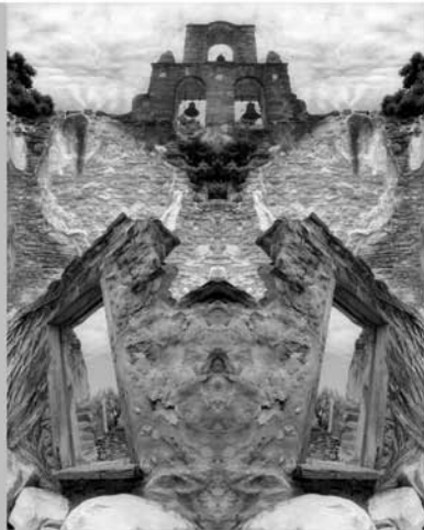
Exhibit on display: September 16, 2003 - January 5, 2004

Airport Art Spaces / Terminal 2 San Antonio International Airport 9800 Airport Boulevard San Antonio, TX 78216