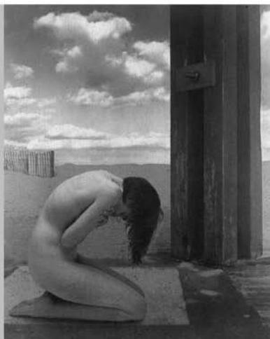
Exhibit funded in part by the Texas Commission On The Arts