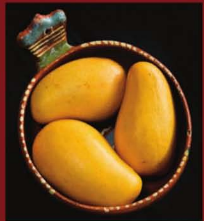
Mamey – The pouteria sapota, a native of Chiapas, is about the color and shape of a small football. Peel away the rough brown skin and the orange red pulp to get to a large black seed. The distinctive delicate flavor of the flesh is reminiscent of sweet potato, pumpkin, or peach. Use it in cakes, ice cream, and licuados.

Come and enjoy this cornucopia of delights from ancient Mexico. Rendon's photographs are more than still-life photographs, they are alive with history and culture. The flavor of his images will whet your appetite for art and food.