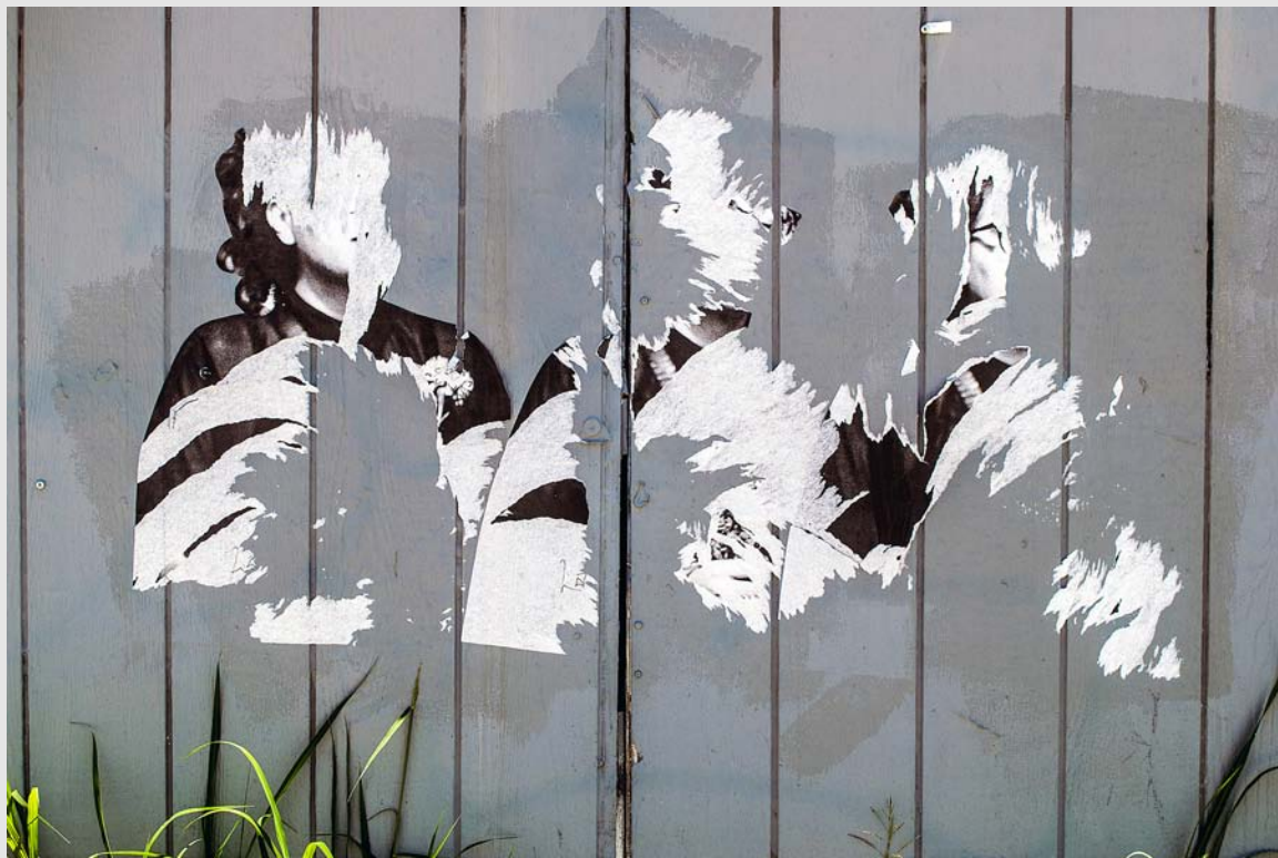
South Brazos Street, April 23, 2016