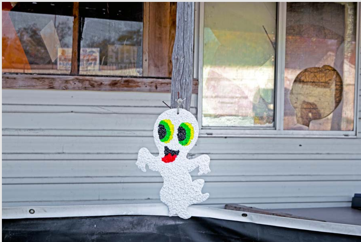
South Hackberry Street, November 23, 2018