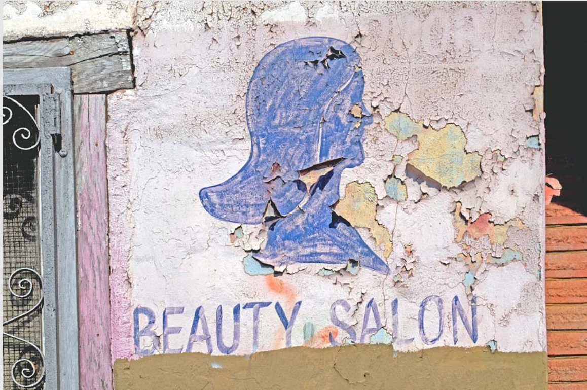
Zarzamora Street, June 9, 2019