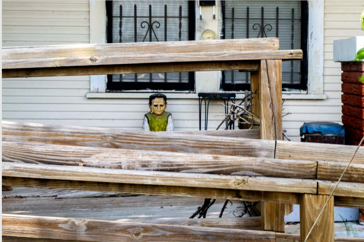
Rigsby Avenue, June 13, 2017