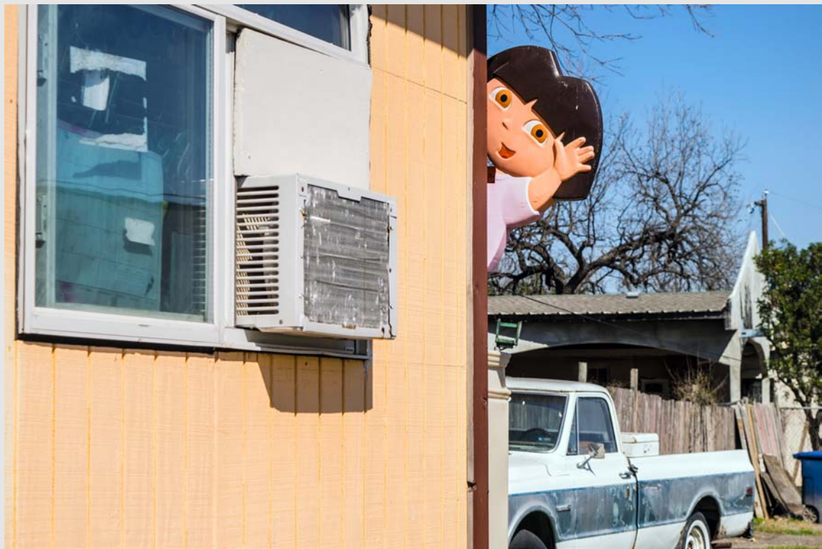
Mitchell Street, February 15, 2016