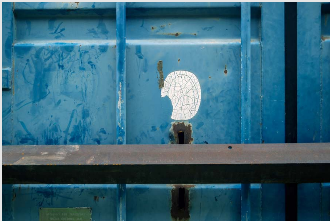
Steves Avenue, April 5, 2020