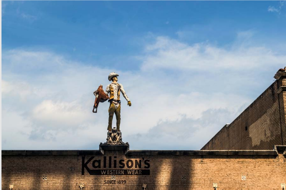
North Flores Street, June 30, 2018