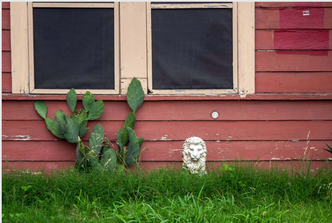
Zarzamora Street, June 16, 2019