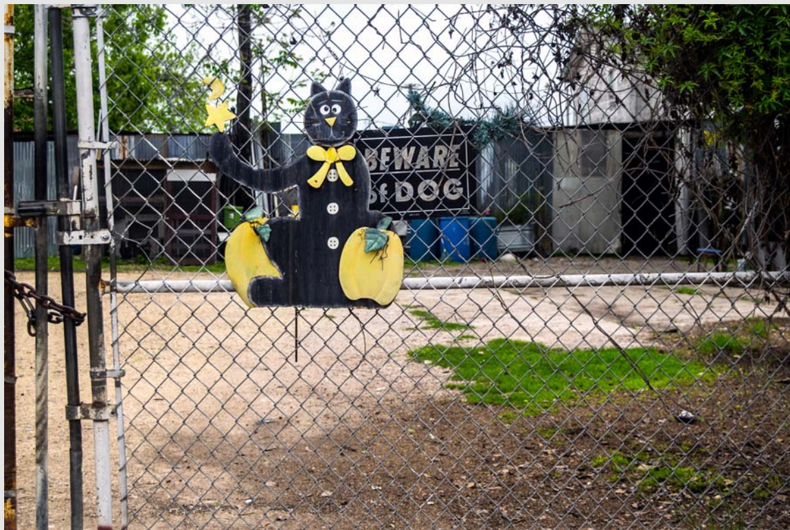
Topeka Boulevard, April 11, 2020