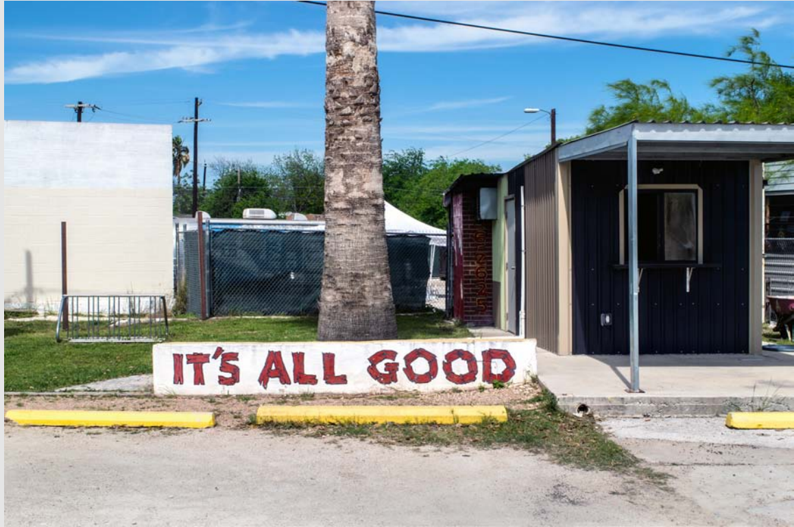
North St. Mary's Street, March 23, 2017