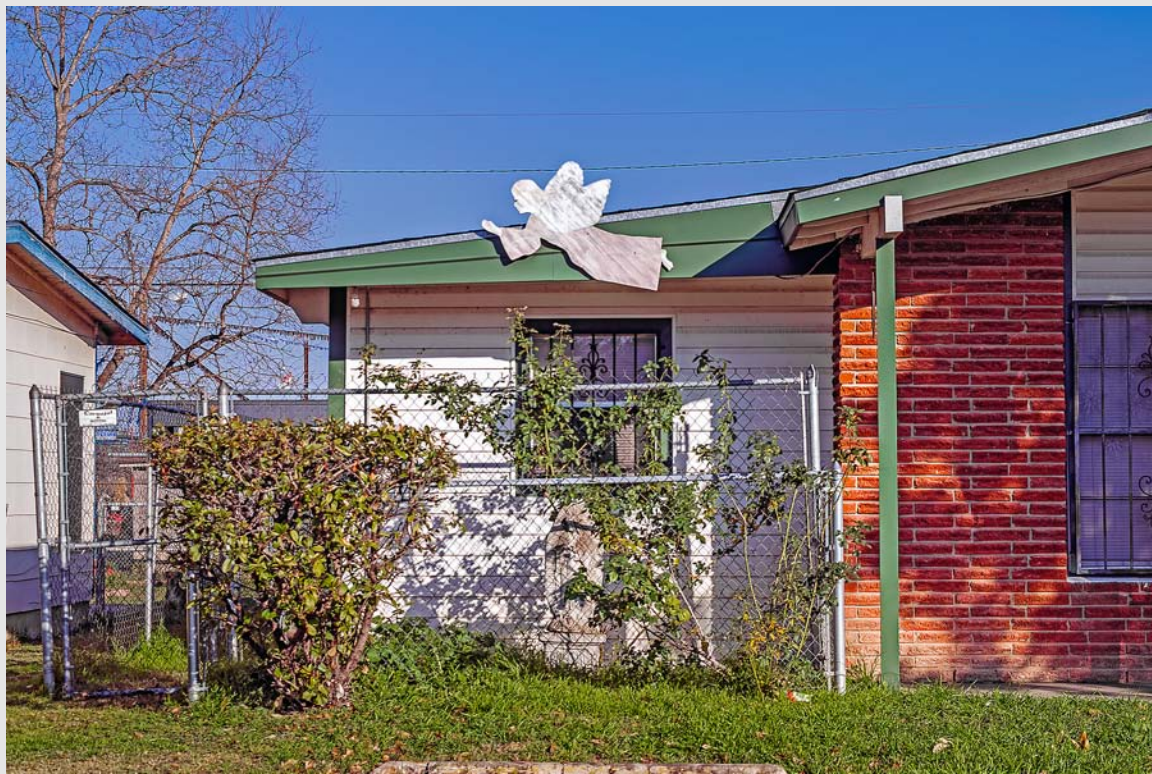
Adelphia Avenue, January 25, 2016