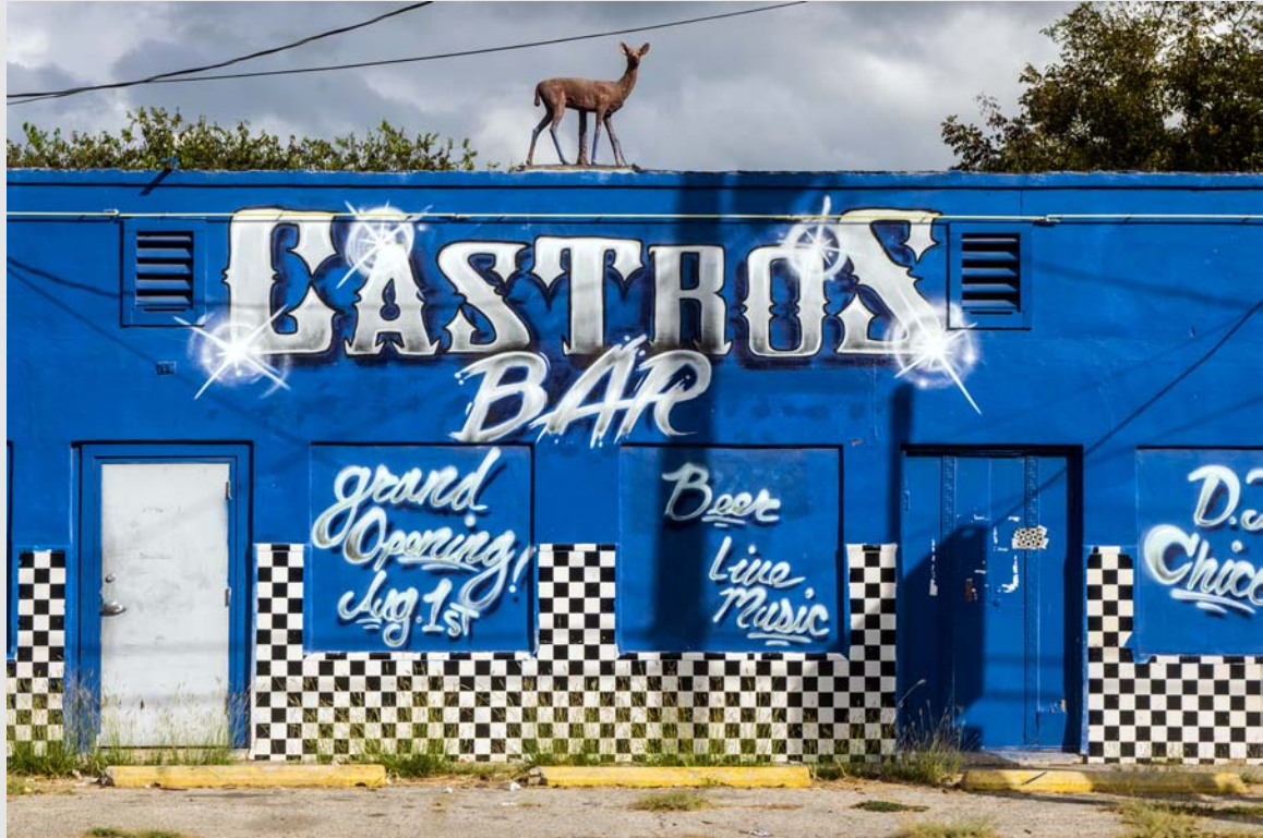
Pleasanton Road, November 6, 2016