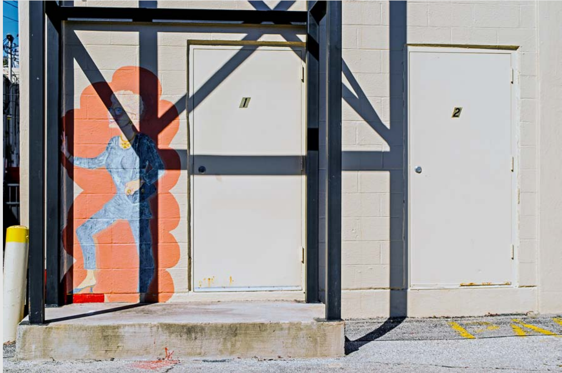
Broadway, February 13, 2016