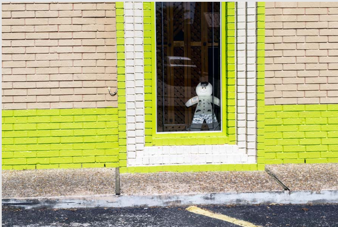
Clark Avenue, October 12, 2016