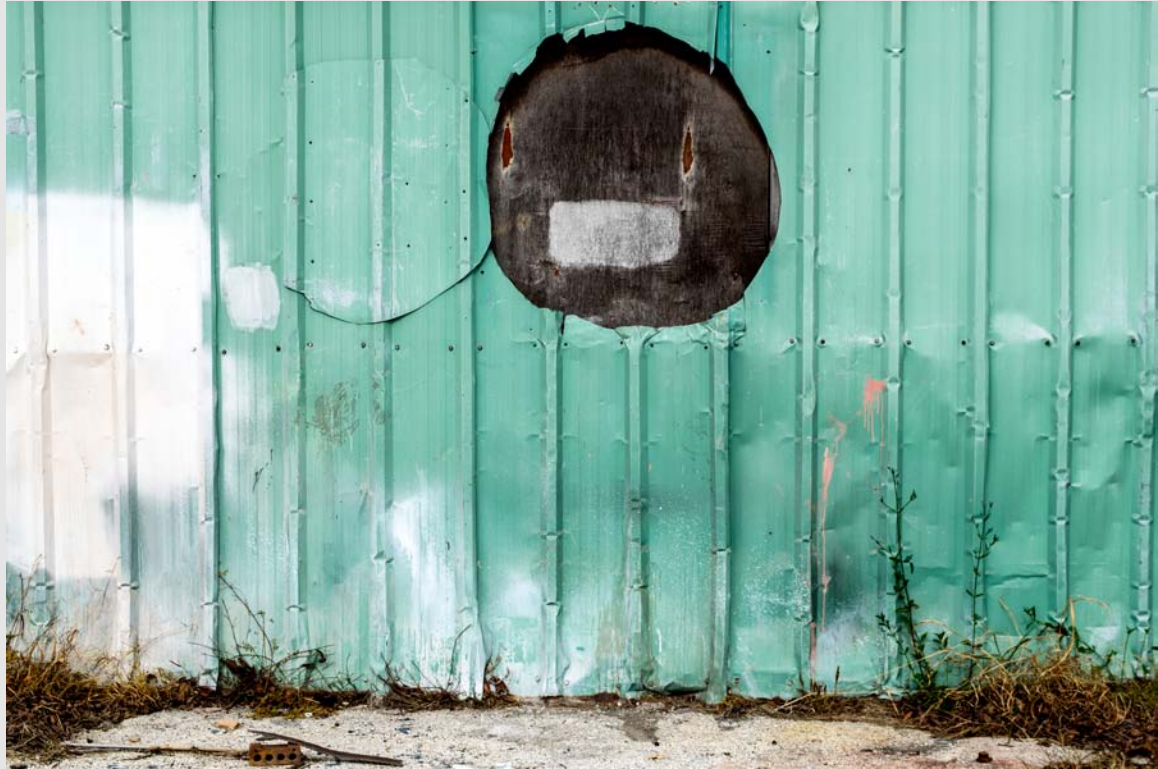
Carolina Street, December 16, 2018