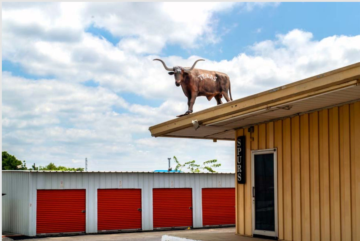
Clark Avenue, June 10, 2017