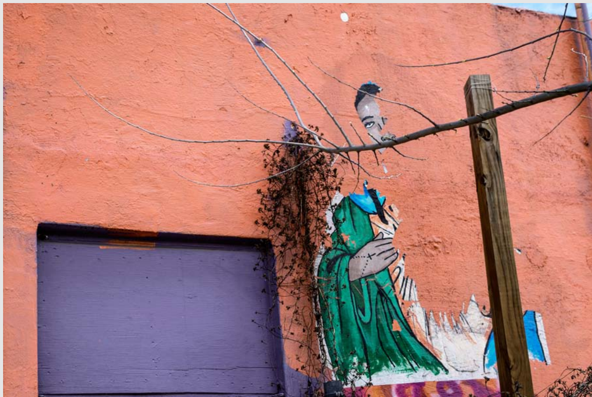
Fredericksburg Road, March 18, 2019