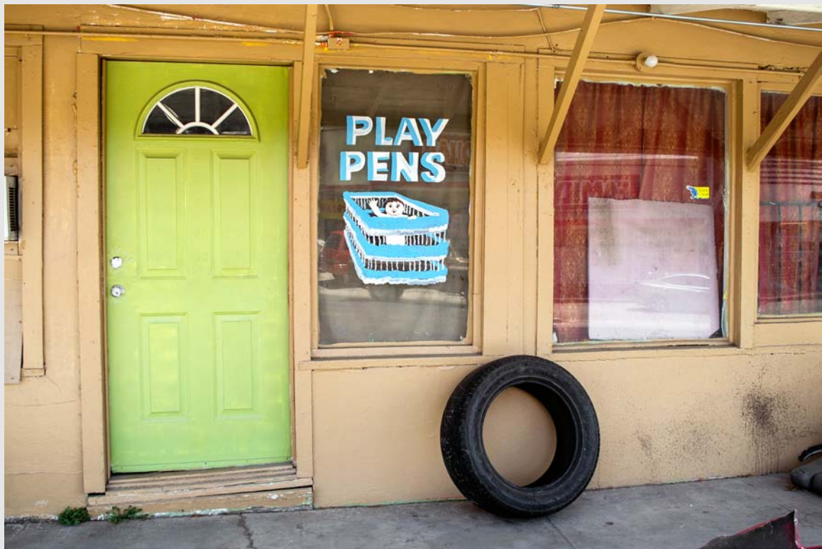
South Flores Street, April 21, 2019