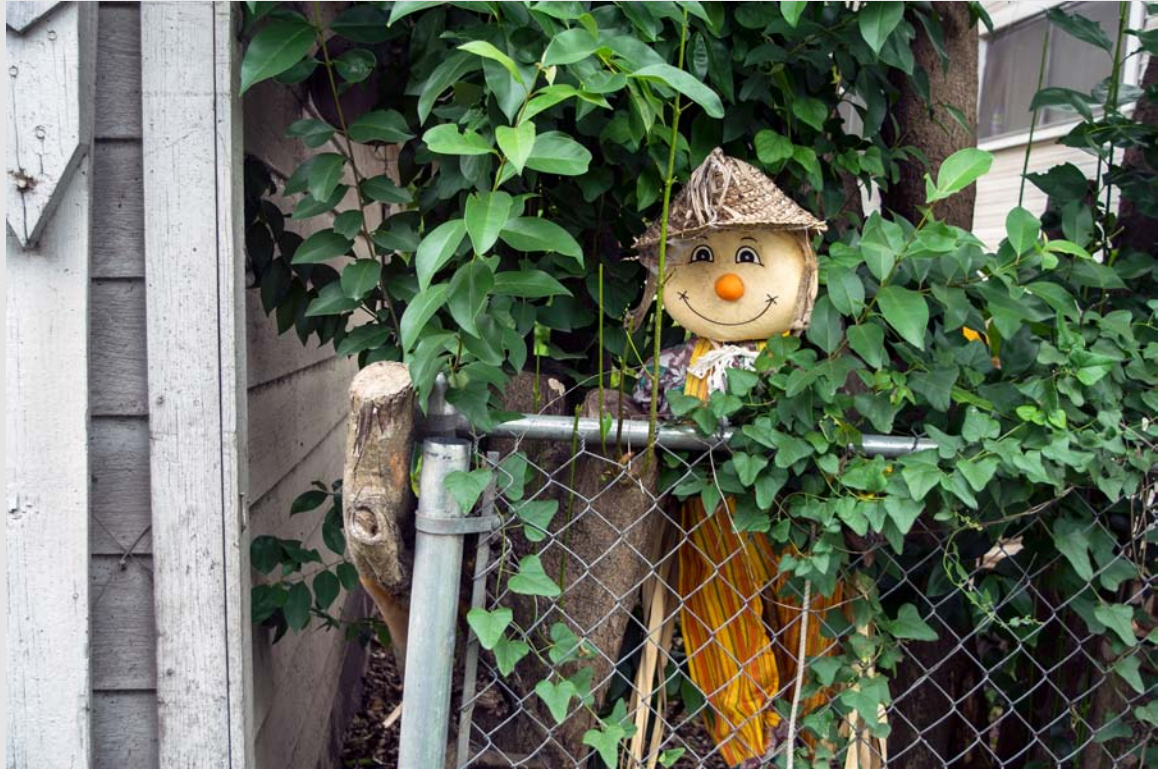
Kirkpatrick Street, November 4, 2018